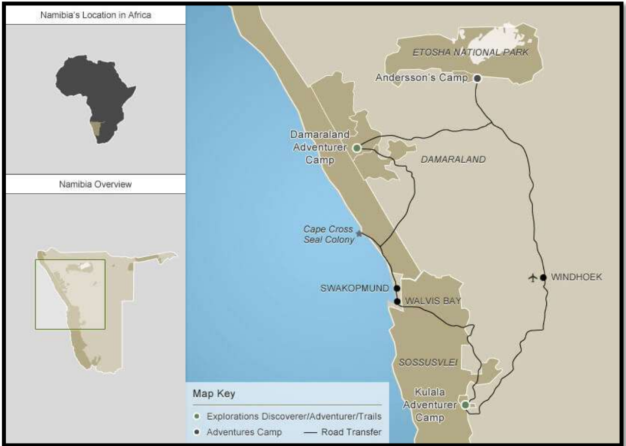
Figure 1 The location of Kulala adventure camp