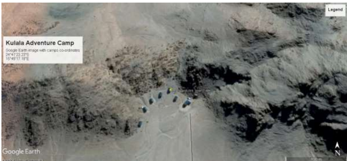
Google Earth image with GPS co-ordinates