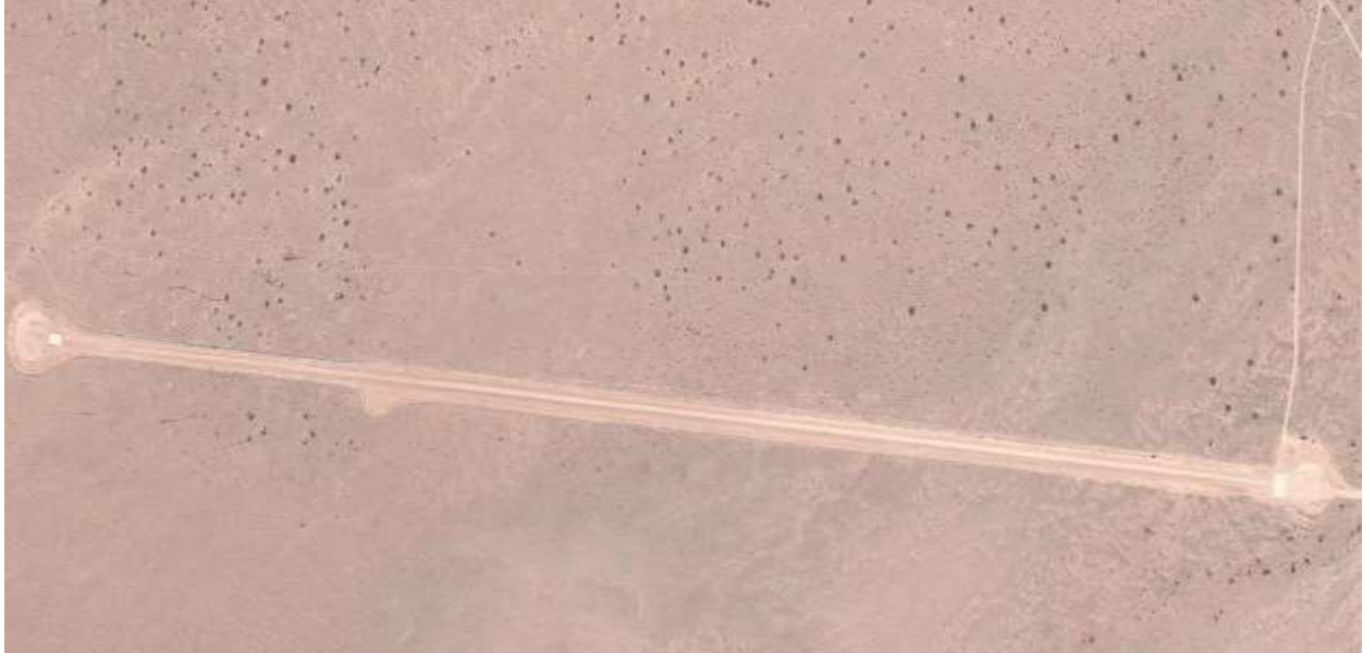
Figure 3: Aerial view of Geluk airstrip