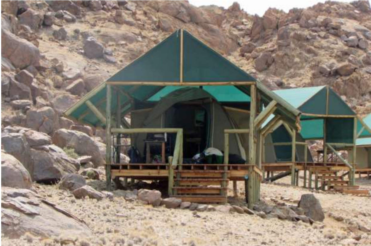
Figure 4: Camps tented chalet