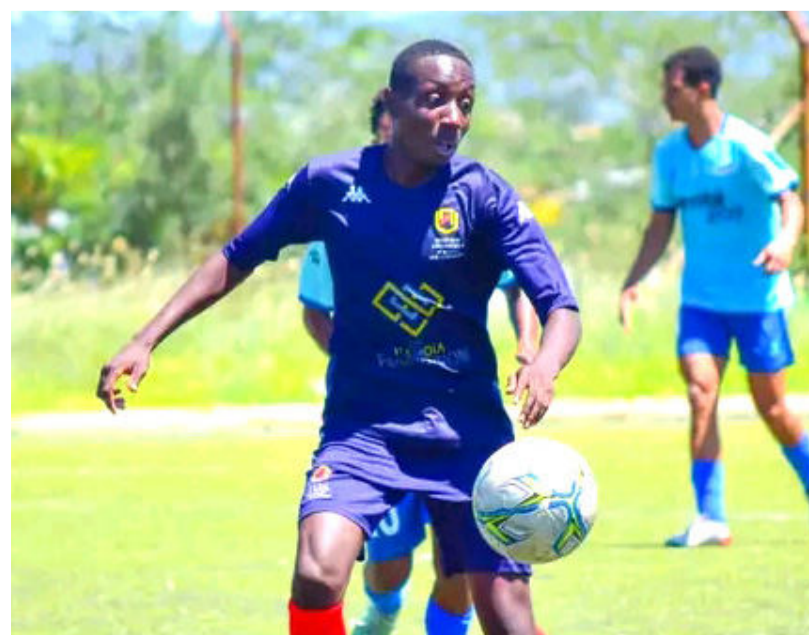
Football Fiesta... Football fans across the country have a buffet of second-division matches as action resumes.

The Zambezi region has nine matchups scheduled for the Katima Mulilo Sports Complex. Green Eagles will host King Fisher in the first game Saturday morning, followed by league leaders Oryza Sativa against Namib Chiefs and Space Age against Blue Chiefs, and Sahara will close off tomorrow fixtures against Black Buffaloes. Round four, slated for Sunday, will pit Power Dynamos against Sahara, Rocano against Oryza Sativa, and Black Buffaloes against Shooting Stars. Namib Chiefs will host Green Dangers before Blue Boys and Bush Bucks wrap up their Sunday schedule. – Nampa