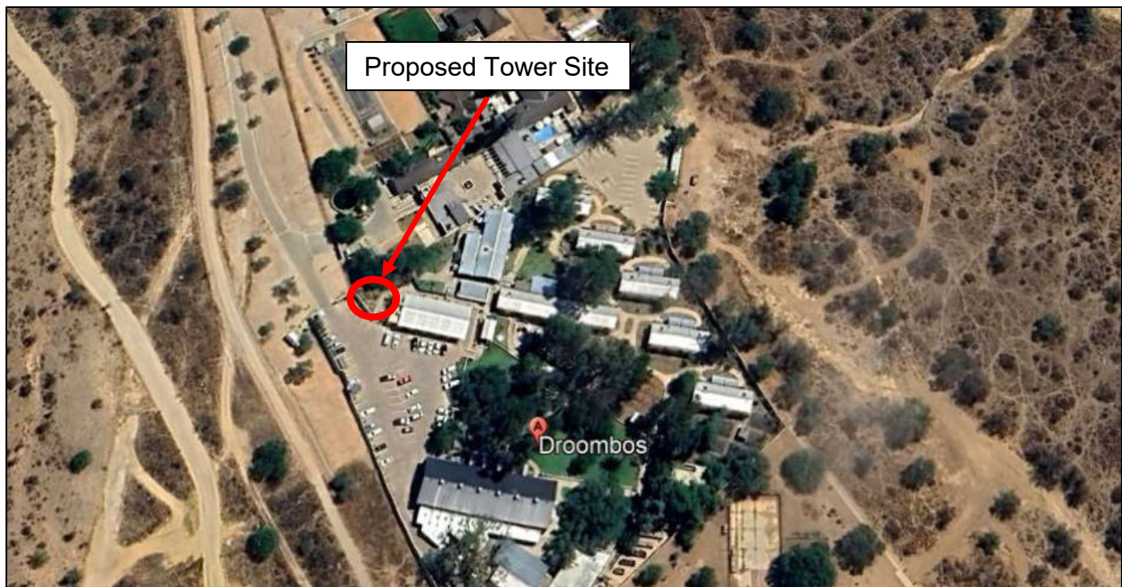
Figure 1: Locality map - Droombos Tower site