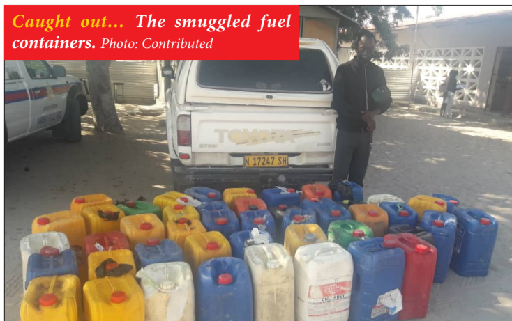
Caught out... The smuggled fuel containers.

The suspect is a resident of Ongenga in Ohangwena. - nashipala@nepc.com.na