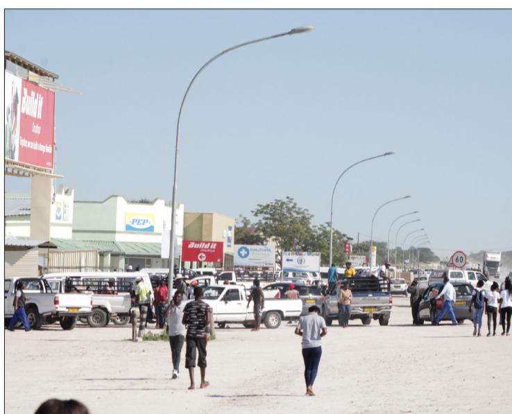
Growing... The Omuthiya Town Council has budgeted an amount of about N$88 million for the current financial year.

“The council has noted with great concern that there is a need to have a community hall in our