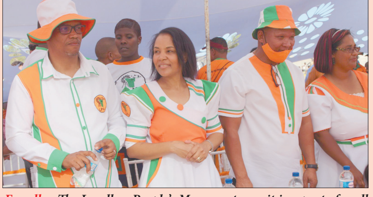
For all... The Landless People's Movement says it is a party for all Namibians.