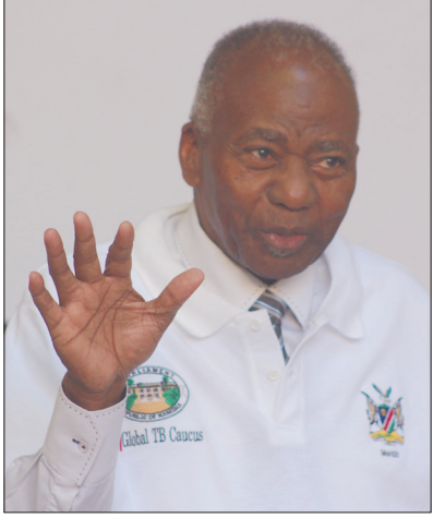
Move fast... Speaker of the National Assembly Peter Katjavivi.

The Holocaust was the genocide of the European Jews. Between 1941 and 1945, across Germanoccupied Europe, Nazi Germany and its collaborators systematically murdered some six million Jews, around two-thirds of Europe's