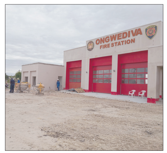
Upgraded... The Ongwediva fire station.