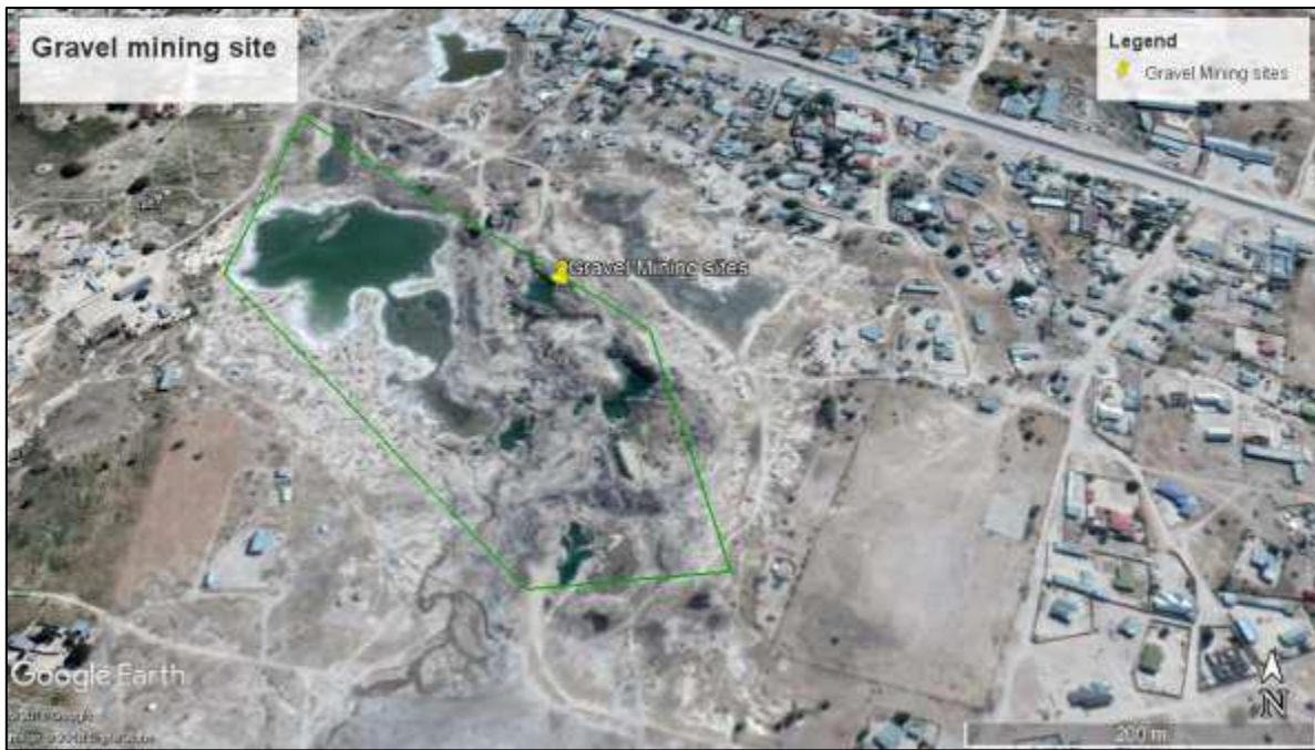
Figure 2: Gravel mining borrow pit location

4 DESCRIPTION OF THE ENVIRONMENT Oniipa Town Council (ONPTC) falls within the Cuvelai-Etoshia Basin (CEB), a transboundary water basin that originates from the highlands (Cuvelai River) in Angola, and spreads across Namibia, resulting in shallow networks of channels locally known as “oshanas”. In Namibia, the shallow network of channels merge and drain into the Etosha Pan known to be the lowest point of the basin. ONPTC is still a relatively new town, and subsistence farming activities (both crops and livestock) occur in the surroundings of the town.