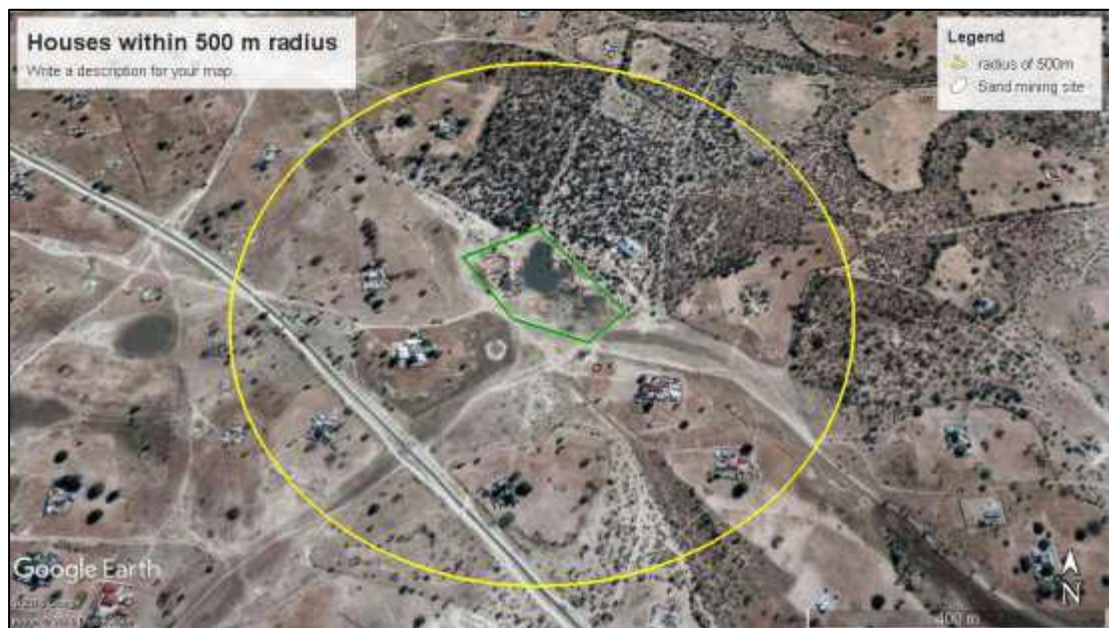
Figure 3: Household within 500 m radius from the sand mining borrow pits

The sand mining pit is located within the Oniipa town lands. Over the past ten years, the site has been mined by several contractors with neither an environmental clearance certificate (ECC) from MET, nor authorization from the town council. Because the borrow pit falls within the jurisdiction of the Oniipa Town Council (ONPTC) townlands, the town council is trying to prevent further illegal mining activities and would like to limit the amount material (sand) by limiting the use to the needs for town development only. The land use in the surrounding area is mainly subsistence farming (both crops and livestock). Figure 3 shows the proximity of households that are within the 500m radius from the borrow site. The borrow pit already exists and further mining activities will not cause new damage to the environment. However, there is a need for ownership, control, monitoring, compliance and rehabilitation of the borrow bit, and hence the application by ONPTC to assume full control