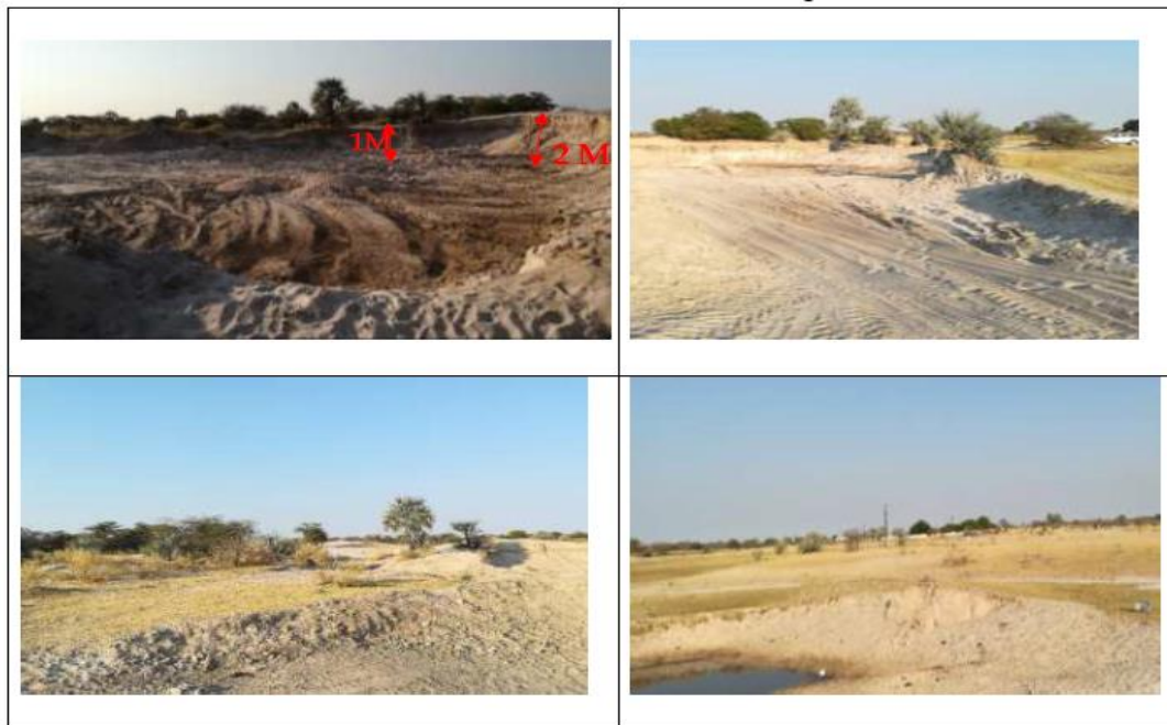
Table 4.1: Pictures of the current situation at the sand mining site

The total area earmarked for sand mining is estimated to be 3 hectares, of which only about 0.8 hectares is currently mined with an estimated volume of approximately 10 000 m 3 . It is estimated that 30,000m 3 of sand is available for extraction. The pictures below in Table 4.1 shows the current situation at the sand mining borrow pits.