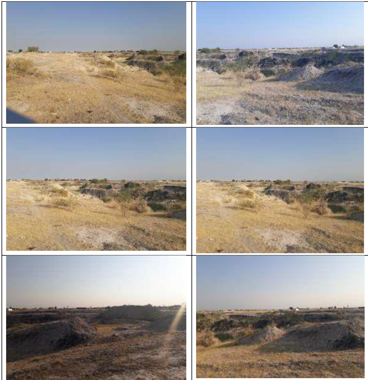
Table 4.2: Pictures depicting the current situation at the gravel mining site