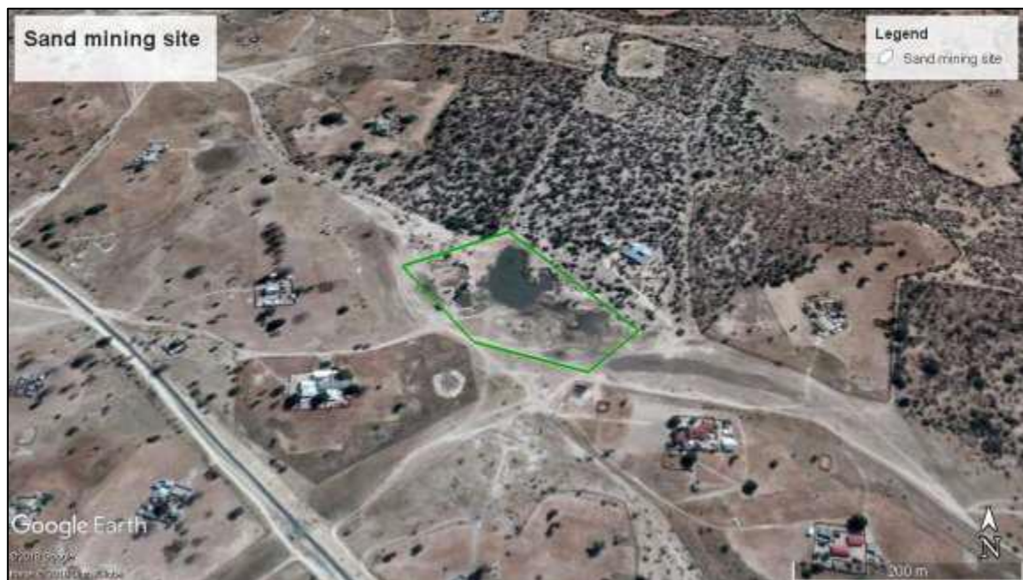
Figure 1: Site location for Sand mining borrow pit

Oniipa town lies north east of Ondangwa town along B1 Omuthiya-Ondangwa Road and D3622 Onethindi-Eenhana Road. Sand and gravel mining operators have been extracting sand and gravel from the existing borrow pits. The two (2) borrow pits are located within the Oniipa Town council (ONPTC) boundaries. Sand mining pit is located on the eastern side of Oniipa town, approximately 2.5 km from the railway and Onethindi-Eenhana road crossing along the railway. The centre of the proposed site is at 17°55'47.8"S 16°03'23.2"E ( https://goo.gl/maps/dWcf4f3NRhL2 ) see Figure 1 below.