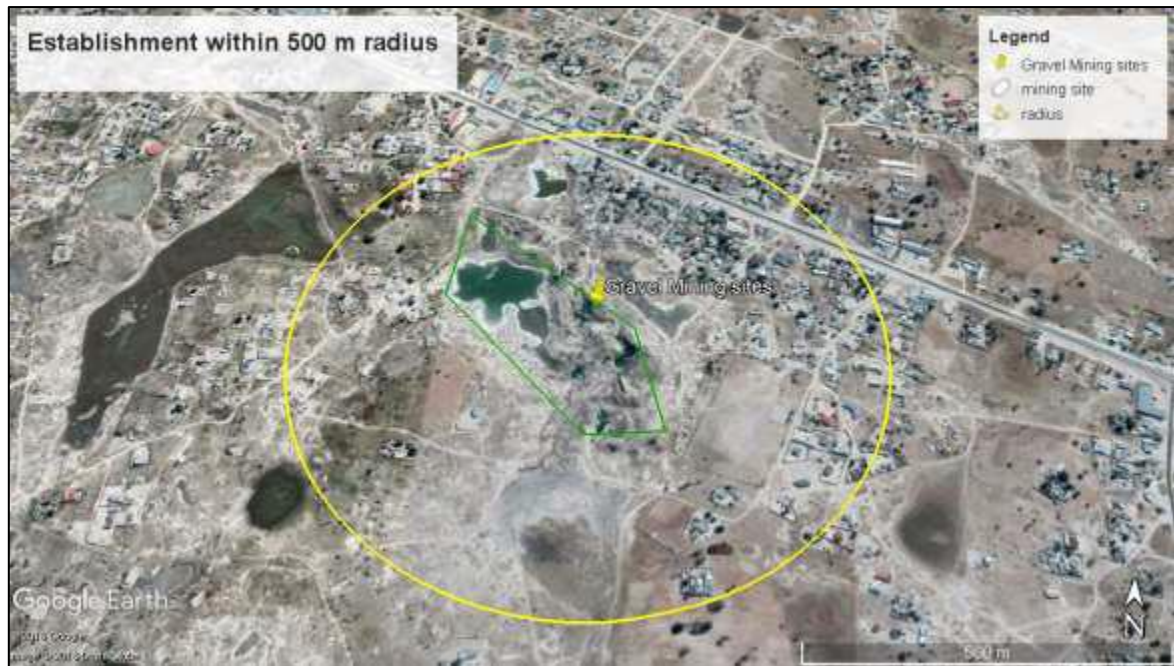
Figure 4: Establishment within 500m radius from the gravel mining borrow pits