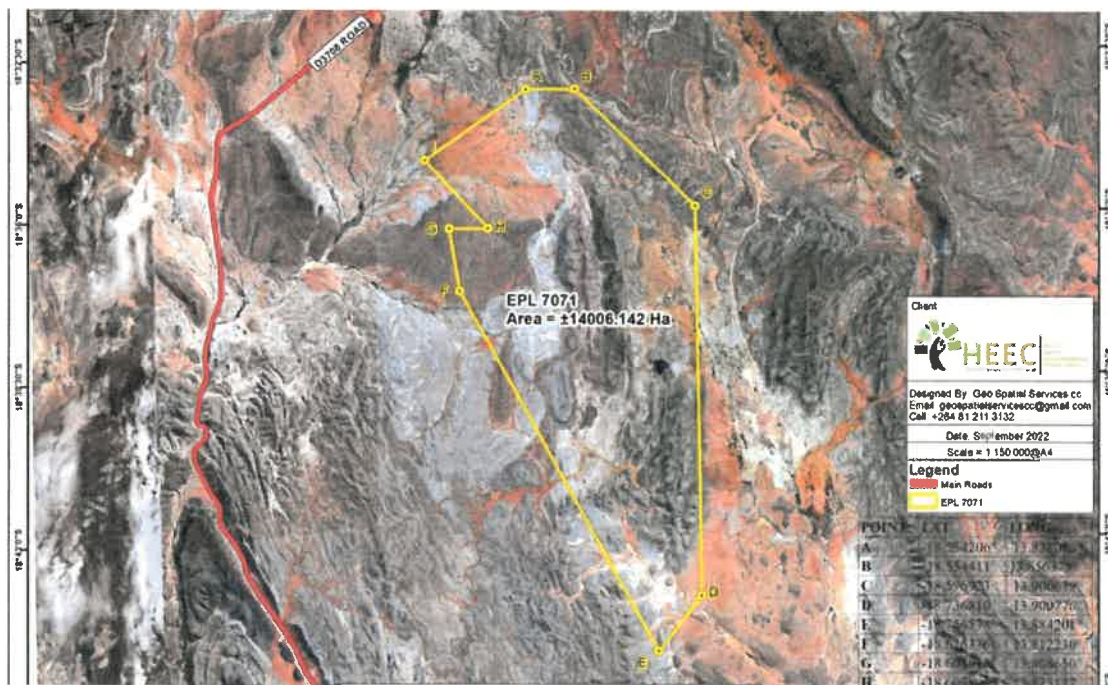
Figure 1: Locality of EPL 7071, Ombombo Village, Kunene Region (GPS Coordinates: -18.63638889, 13.86472222)

It is with this background that Aloe Investments Two Hundred and Thirty Eight (Pty) Ltd has decided to continue exploration activities for base and rare metals & precious metals targeting copper ore for commercial purposes and derive the monetary benefits associated with the extraction of these natural resources as he is a holder of the application for the Exclusive Prospecting Licence (EPL) 7071 from the Ministry of Mines and Energy after following all the necessary procedures to satisfy the relevant Authorities enabling them to explore for the targeted minerals (copper ore) from the allocated portions on the EPL 7071. The scope of this project is limited to applying for the renewal of the environmental clearance certificate for the exploration activities for Exclusive Prospecting License (EPL) NO. 7071 Northwest of Ombombo Village, Kunene Region, Namibia that was issued on 19 December 2019 and expires on 19 December 2022 See Figure 1 for the locality of the EPL7071.