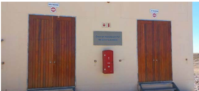
Photo 14 – View of site's substation building with fire extinguisher.