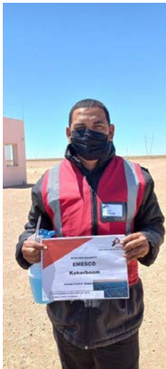
Photo 2 – View of Project site security guard with visitor's register book.