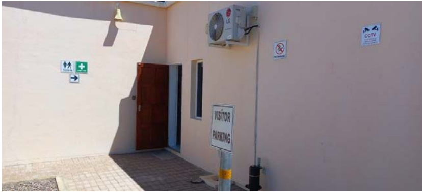
Photo 4 – View of site office with clearly marked signs.