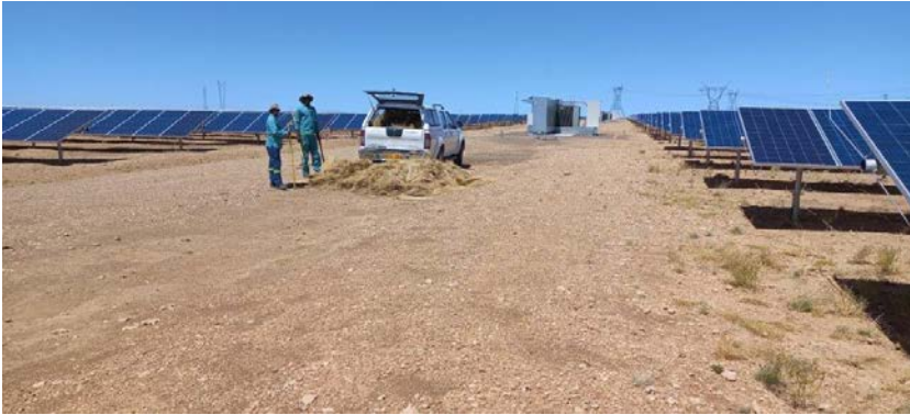
Photo 27 – View of workers loading grass that was cleared in between the PV panels.