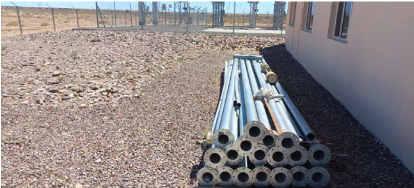
Photo 9 – View of laydown area at site warehouse, kept neat and tidy.