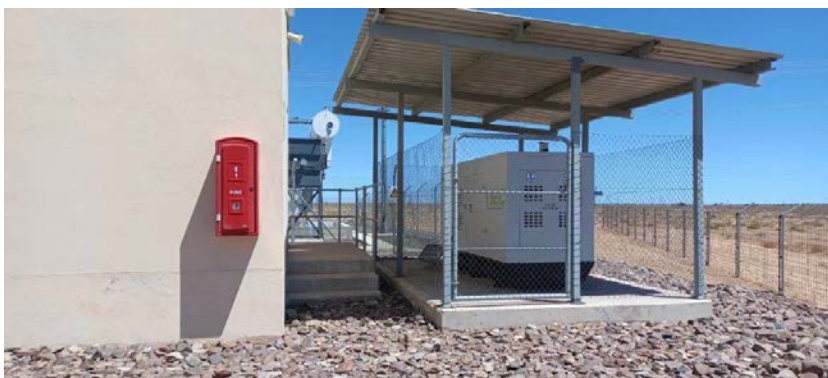
Photo 16 – View of back-up generator to the back of the site office's substation building with fire extinguisher.