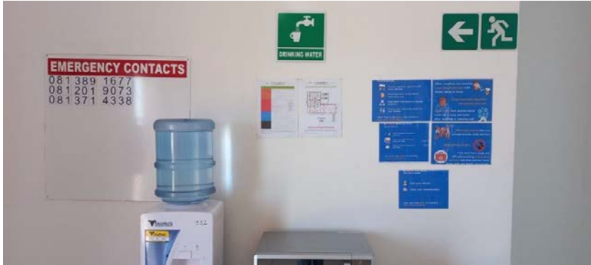
Photo 6 – View of reception area within site office displaying health and safety information and emergency numbers.