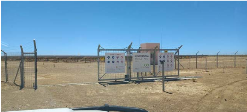
Photo 1 – View of Project site entrance displaying information and warning signs.