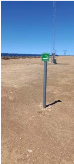
Photo 17 – View of smoking sign indicating dedicated smoking area, close to site office. A sand bucket should be provided at the smoking sign.