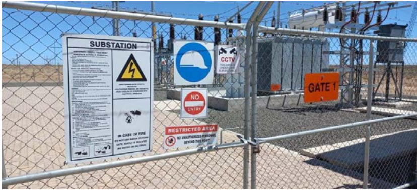
Photo 13 – View of entrance gate to site substation. Access is restricted and warning signs displayed on the fence.