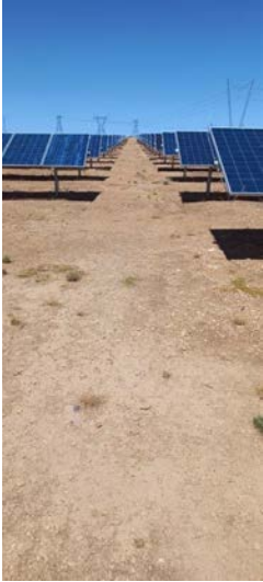
Photo 26 – View of lane in between PV sections have sparse vegetation cover.