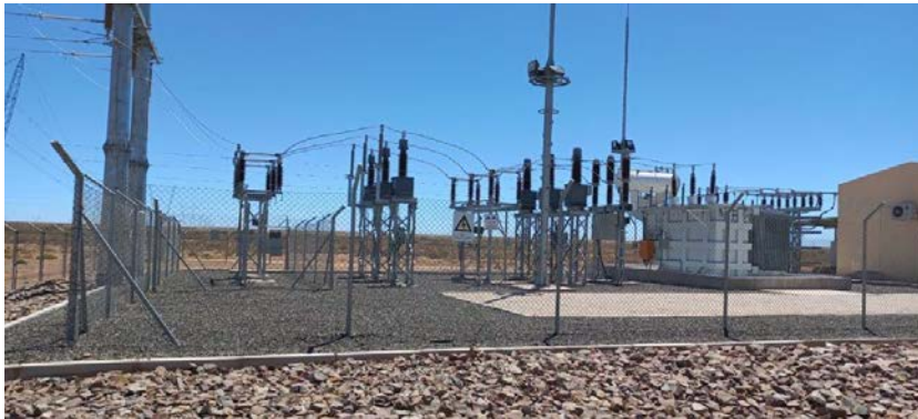
Photo 11 – View of site's substation fenced-in and well maintained.