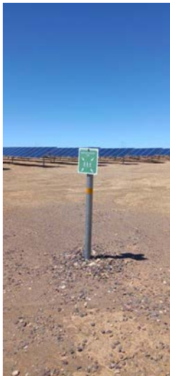
Photo 18 – View of emergency gathering point, close to site office.