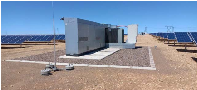
Photo 24 – View of site inverter, well maintained and area surrounding equipment kept clean.