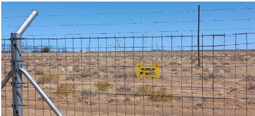
Photo 22 – View of site fence with warning sign of electric fence.