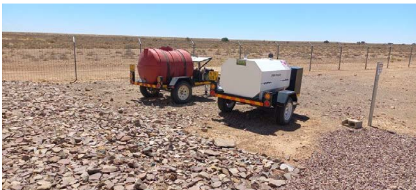
Photo 15 – View of firefighting trailer (left) and refuel diesel trailer, both operational and in good working condition.