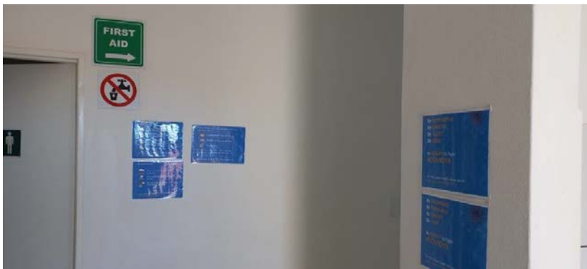
Photo 5 – View of reception area within site office displaying health and safety information and first aid room.