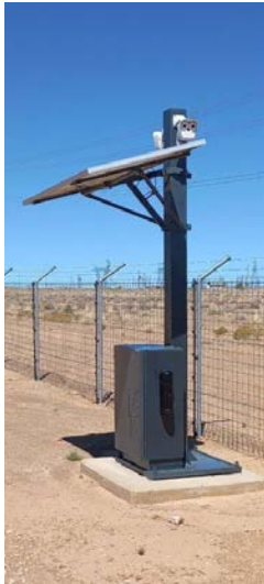
Photo 23 – View of 24/7 security cameras along the Project's boundary fence.