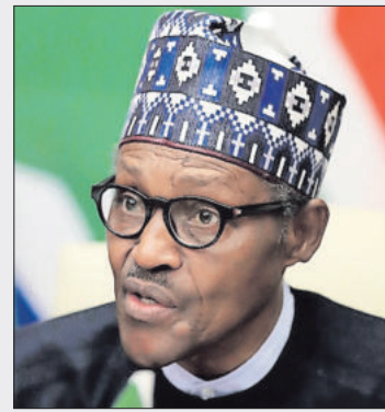
Nigeria's President Muhammadu Buhari.

ing markets economist at Capital Economics.