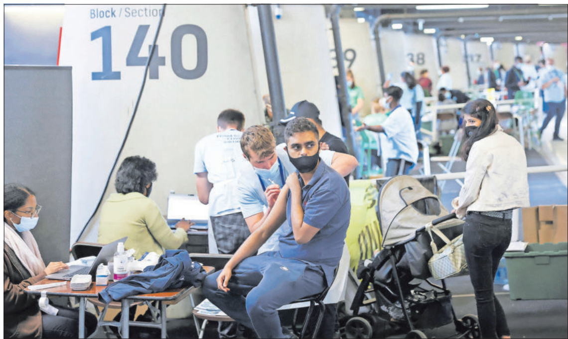
A person receives a dose of the Pfizer BioNTech Covid-19 vaccine at a mass vaccination centre.