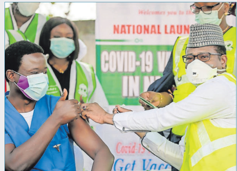
About 2.3% of Nigerians or 2.54 million people have been fully vaccinated.