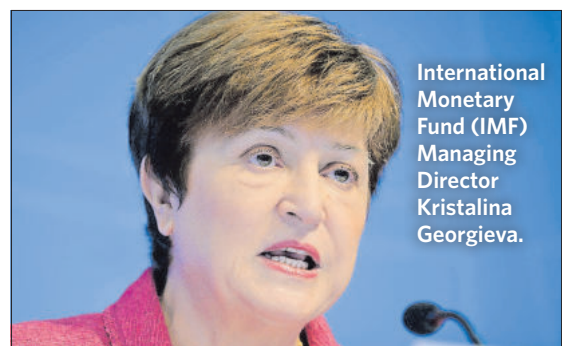
International Monetary Fund (IMF) Managing Director Kristalina Georgieva.

But Georgieva said the "more fundamental problem" is the growing divergence between "countries that are pulling forward more strongly, and those that are falling behind," largely due to the drastically lower vac-