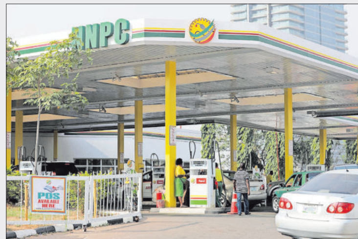
Buhari said a fuel subsidy which successive governments have tried unsuccessfully to scrap, continued to erode revenues.