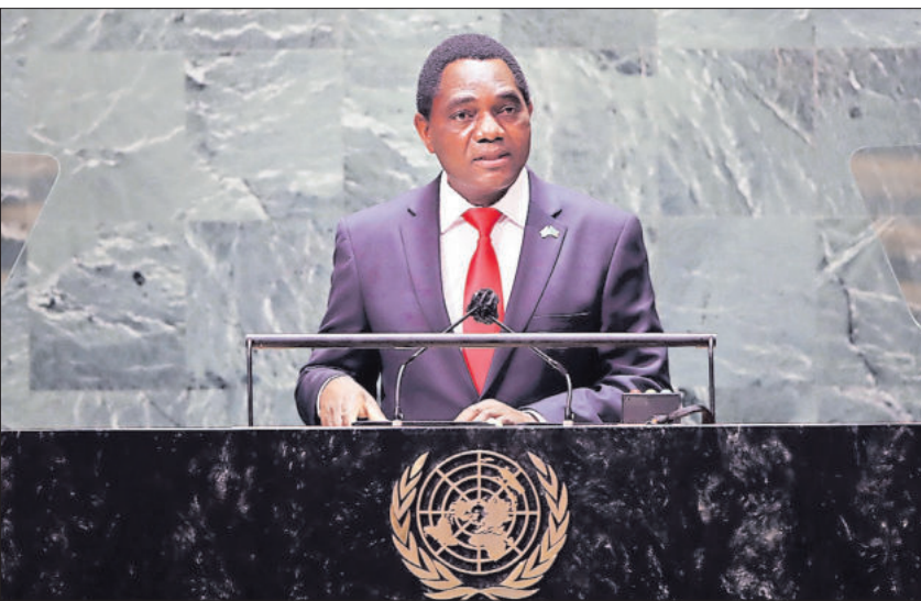
Zambia's President Hakainde Hichilema.