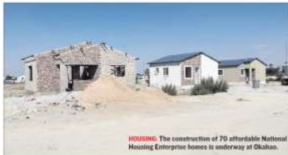
HOUSING: The construction of 70 affordable National Housing Enterprise homes is underway at Okahao.

"We are all serious about this country," one of the community members, who preferred to remain anonymous, said.