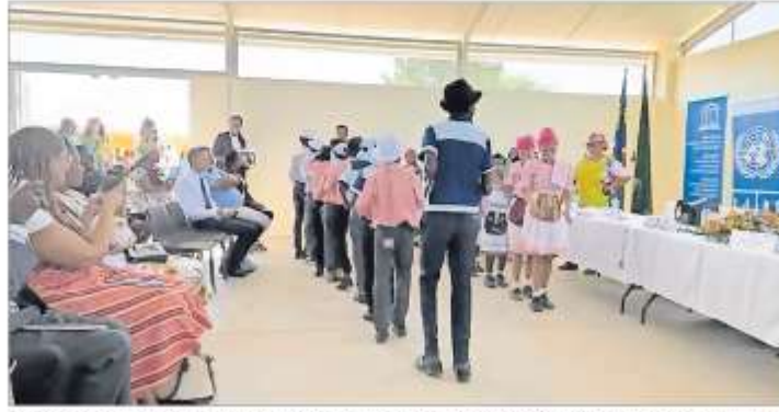
Calle Schlettwein het in sy toespraak gesê dat die vraag na water by Groot Aub oor die afgelope jare gegroei het.

Schlettwein het in sy toespraak gesê, soos voorgesien deur die ministerie se uitverreende direkteur, Ndyakanyi Ndiyitwamata – dat die vraag na water by Groot Aub oor die afgelope jare gegroei het vanweë die bevolkinggroei wat in die nedersetting irrasie word. Mensse het halsaf hier soos vestig op soek na behuising en