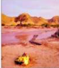
FLOOD: A tour group set up camp next to a strong-flowing Hoarusib River.