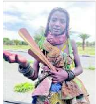
Minderjarige kinders van Angola bedel en verkoop houtlepels en kerries op straat.

VAN BL. 1 'n Angolese man wat ook hier verkoop en al jare lank in Namibië woon, het onder voorwaarde van anonimiteit aan Namibian Sun gesê dat die vroue en kinders vir 'n sakeman in Angola werk. Die man bly in Lubango en wanneer die lepels klaar verkoop is, moet hulle terugkom, nog kry en weer terugkom. "Jy kan hierdie goed net in Angola kry - hulle word net in Angola gemaak", het hy gesê. Een Mwila-vrou, bekend