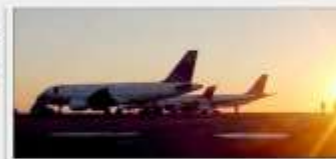
THORN IN THE FLESH: Two Air Namibia aircraft parked on the tarmac of the Hosea Kutako International Airport.

Two years down the line, Air Namibia's closure and the consequences thereof have had a significant impact on the NAC, which