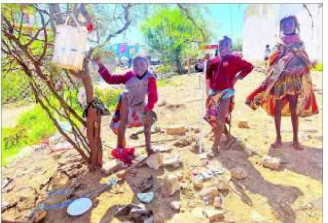
Angolese kinders met hul ma's slaap onder die boom in Windhoek.