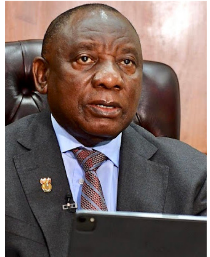
South African President Cyril Ramaphosa