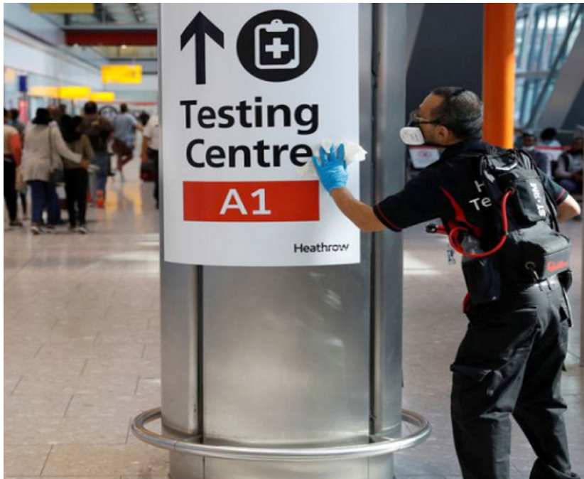
A worker sanitises a sign at the International arrivals area of Terminal 5 in London's Heathrow Airport, Britain, August 2, 2021