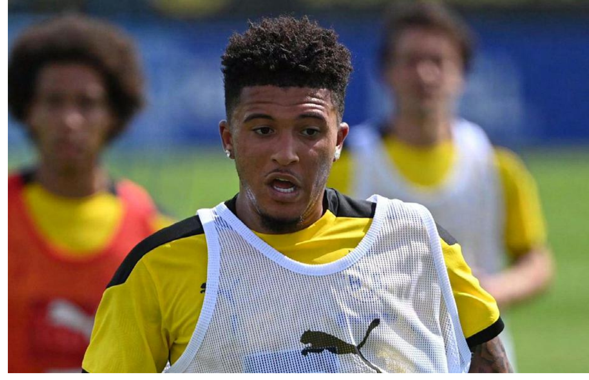
Borussia Dortmund want a fee of about £100m for winger Jadon Sancho