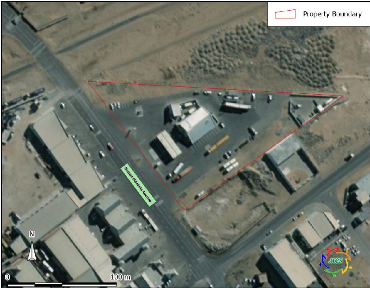
Figure 2. Layout of the site