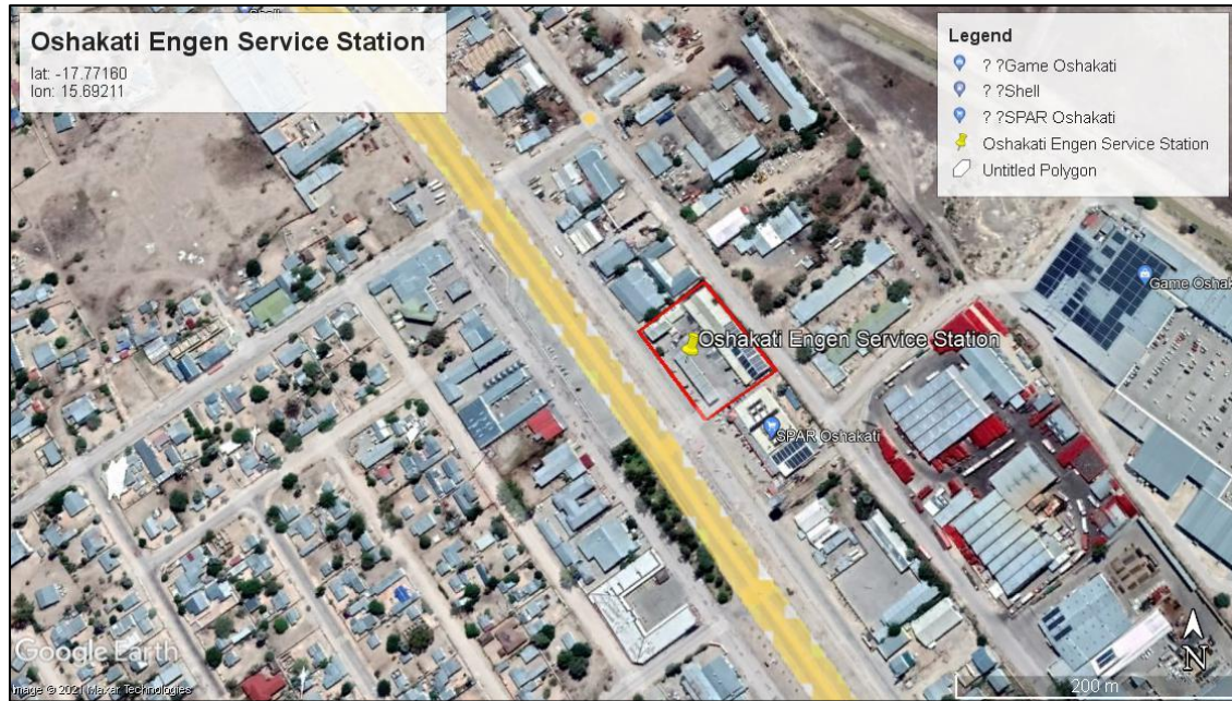
Figure 1: Locality Map of Oshakati Engen Service Station (Google, 2021)

In terms of the Environmental Management Act 7 of 2007 (Government Notice No. 29), certain activities may not be undertaken without an Environmental Clearance Certificate (ECC). This activity is included in the above-mentioned list, with particular reference to the following activities of the gazetted Namibian Government Notice No. 30 Environmental Impact Assessment Regulations: Activity 9.2 Any process or activity which requires a permit, licence or other form of authorisation, or the modification of or changes to existing facilities for any process or activity which requires an amendment of an existing permit, licence or authorisation or which requires a new permit, licence or authorisation in terms of a law governing the generation or release of emissions, pollution, effluent or waste.