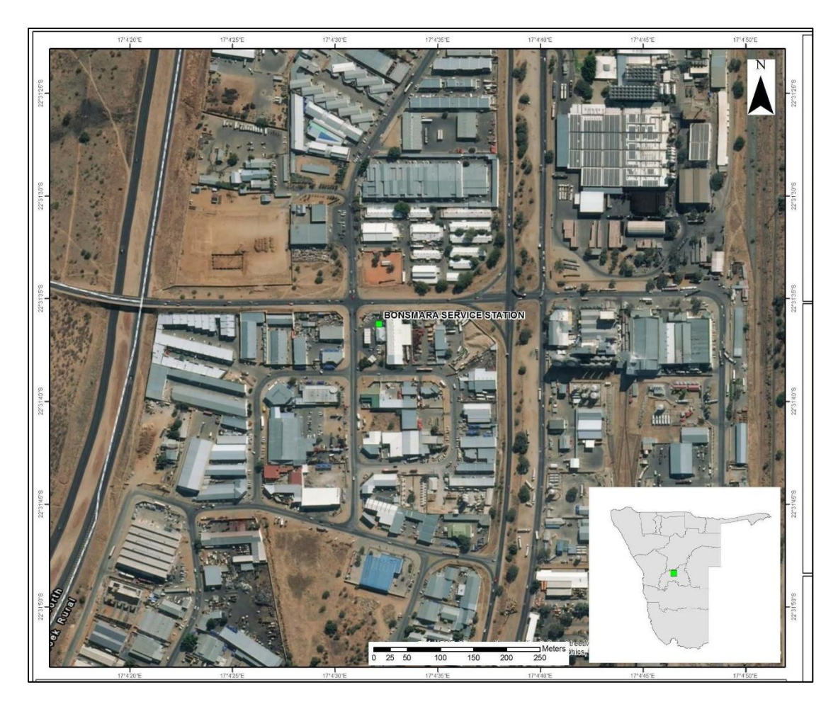
Figure 1: Locality Map of Bonsmara Service Station (Engen, 2017)

In terms of the Environmental Management Act 7 of 2007 (Government Notice No. 29), certain activities may not be undertaken without an Environmental Clearance Certificate (ECC). This activity is included in the above-mentioned list, with particular reference to the following activities of the gazetted Namibian Government Notice No. 30 Environmental Impact Assessment Regulations: Activity 9.2 Any process or activity which requires a permit, licence or other form of authorisation, or the modification of or changes to existing facilities for any process or activity which requires an amendment of an existing permit, licence or authorisation or which requires a new permit, licence or authorisation or release of emissions, pollution, effluent or waste.