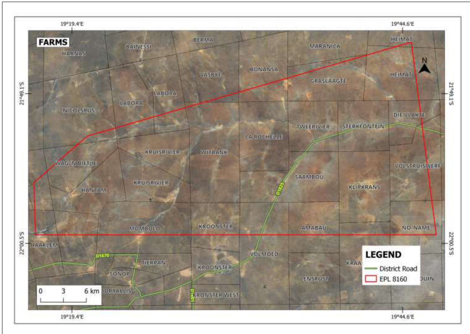
Figure 2: Land Use Map