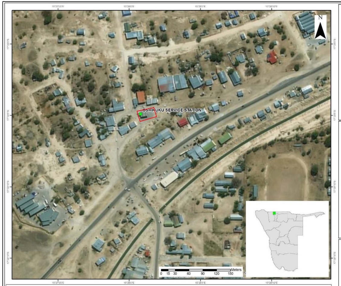
Figure 1: Locality Map of Oshikuku Service Station (Engen, 2017)

In terms of the Environmental Management Act 7 of 2007 (Government Notice No. 29), certain activities may not be undertaken without an Environmental Clearance Certificate (ECC). This activity is included in the above-mentioned list, with particular reference to the following activities of the gazetted Namibian Government Notice No. 30 Environmental Impact Assessment Regulations: Activity 9.2 Any process or activity which requires a permit, licence or other form of authorisation, or the modification of or changes to existing facilities for any process or activity which requires an amendment of an existing permit, licence or authorisation or which requires a new permit, licence or authorisation in terms of a law governing the generation or release of emissions, pollution, effluent or waste.