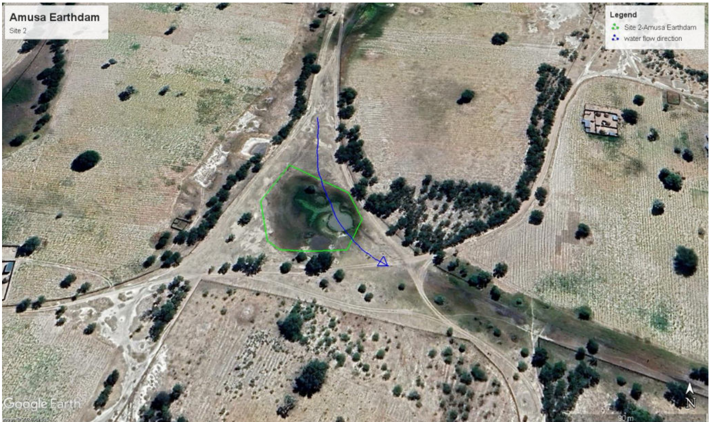
Figure 2-1: Proposed earth dam site

The earth dam will be constructed in Amusa village (figure 2.1).