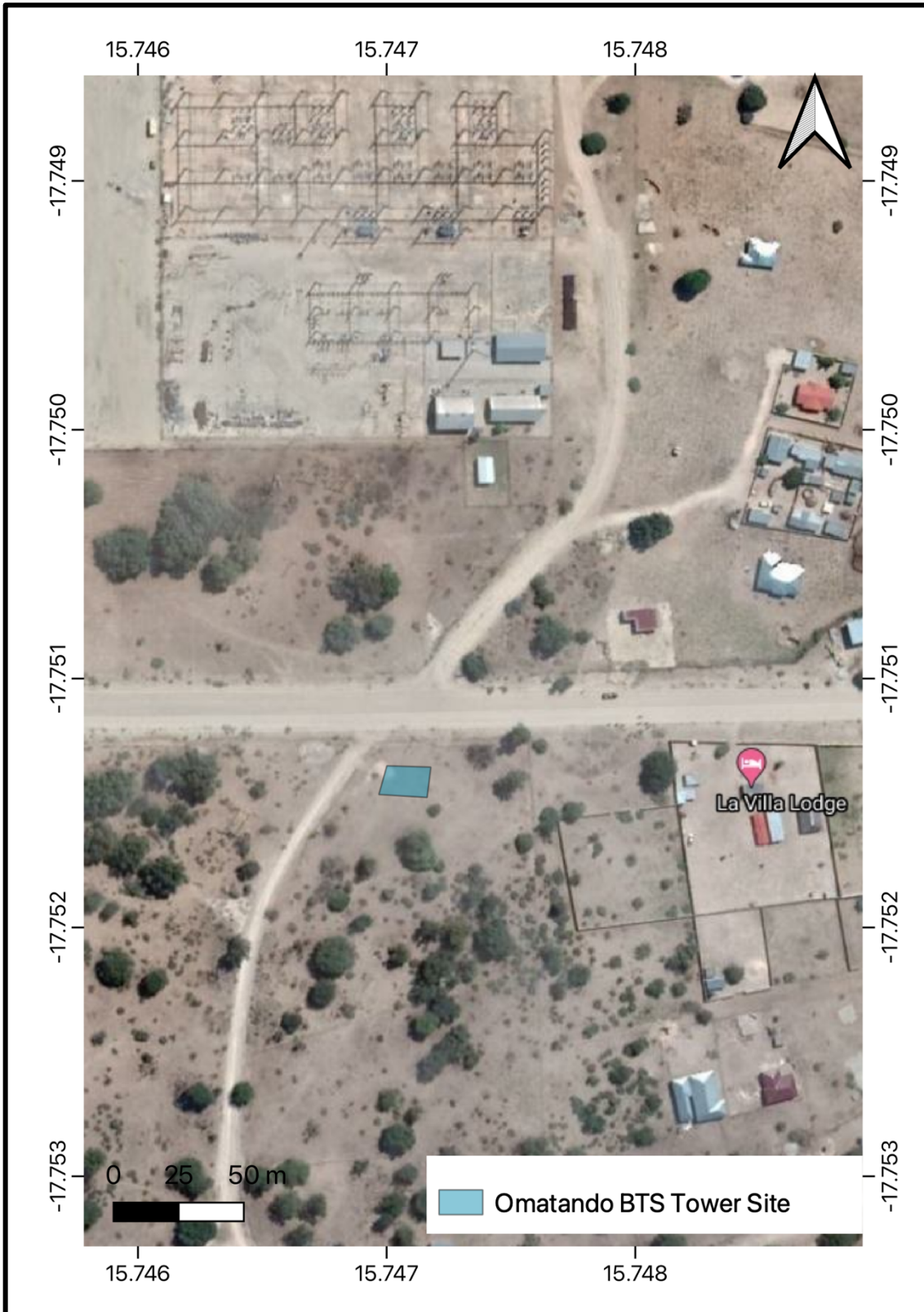
Figure 1: Proposed Project Site.