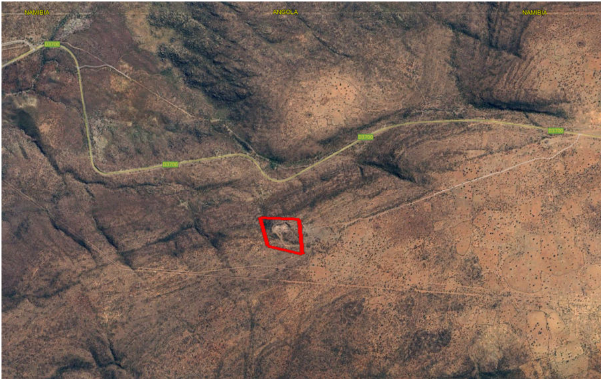
Figure 1: Location of Mavinga Stone Quarry and Crusher

The aim of an operational EMP is to ensure that the existing stone quarry and crusher project is conducted in an environmentally acceptable and safe manner. This Environmental Management Plan (EMP) will serve as a managing tool for the operational activities during the operational phase of the Mavinga Quarry and Stone Crusher project, in Omatemba, Ruacana. (See figure 1. below).