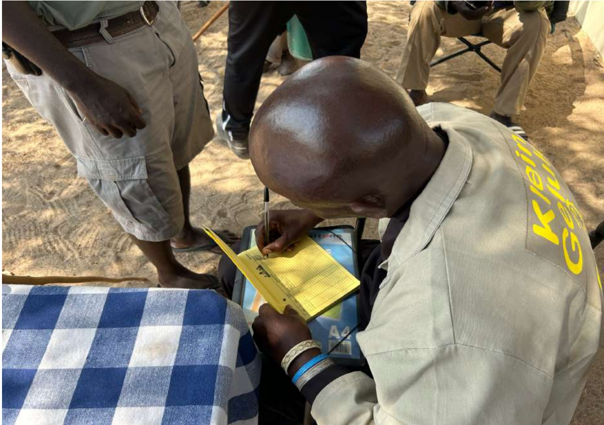
Figure 2 signing of conservancy attendance book