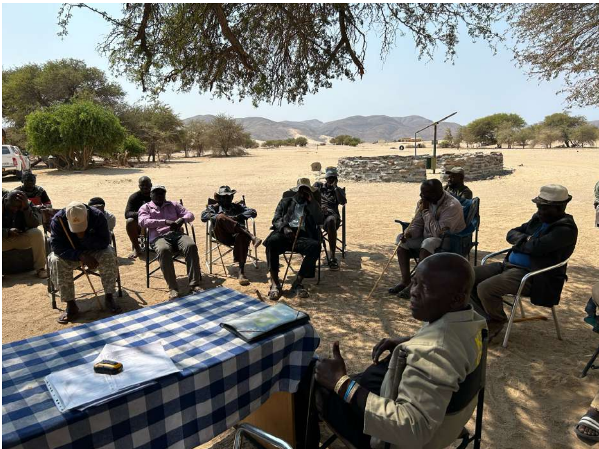
Figure 1 Puros Community meeting (25 August 2023)