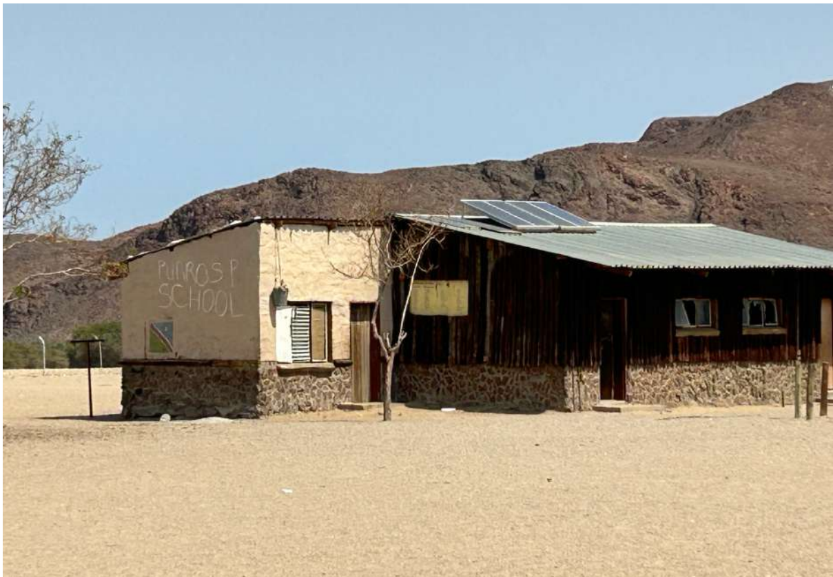
Figure 3 Puros Primary School - Solar System

Proposed Solar Powered Minigrid for the Puros Community In the Puros Conservancy, part of Sesfontein Constituency, Kunene Region.