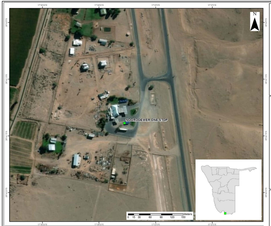
Figure 1: Locality Map of Noordoewer One Stop Service Station (Engen, 2017)

In terms of the Environmental Management Act 7 of 2007 (Government Notice No. 29), certain activities may not be undertaken without an Environmental Clearance Certificate (ECC). This activity is included in the above-mentioned list, with particular reference to the following activities of the gazetted Namibian Government Notice No. 30 Environmental Impact Assessment Regulations: Activity 9.2 Any process or activity which requires a permit, licence or other form of authorisation, or the modification of or changes to existing facilities for any process or activity which requires an amendment of an existing permit, licence or authorisation or which requires a new permit, licence or authorisation in terms of a law governing the generation or release of emissions, pollution, effluent or waste.