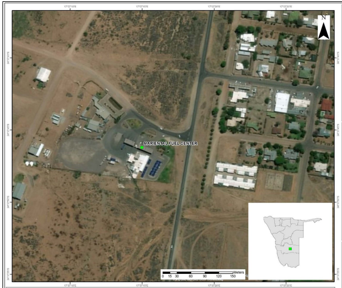
Figure 1: Locality Map of Mariental Fuel Centre (Engen, 2017)

In terms of the Environmental Management Act 7 of 2007 (Government Notice No. 29), certain activities may not be undertaken without an Environmental Clearance Certificate (ECC). This activity is included in the above-mentioned list, with particular reference to the following activities of the gazetted Namibian Government Notice No. 30 Environmental Impact Assessment Regulations: Activity 9.2 Any process or activity which requires a permit, licence or other form of authorisation, or the modification of or changes to existing facilities for any process or activity which requires an amendment of an existing permit, licence or authorisation or which requires a new permit, licence or authorisation in terms of a law governing the generation or release of emissions, pollution, effluent or waste.