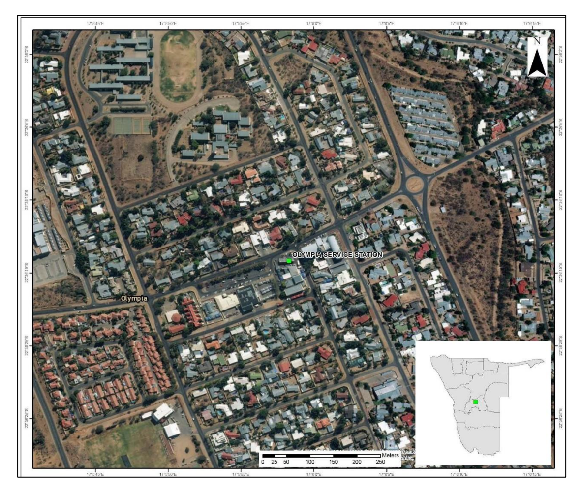
Figure 1: Locality Map of Olympia Service Station (Engen, 2017)

In terms of the Environmental Management Act 7 of 2007 (Government Notice No. 29), certain activities may not be undertaken without an Environmental Clearance Certificate (ECC). This activity is included in the above-mentioned list, with particular reference to the following activities of the gazetted Namibian Government Notice No. 30 Environmental Impact Assessment Regulations: Activity 9.2 Any process or activity which requires a permit, licence or other form of authorisation, or the modification of or changes to existing facilities for any process or activity which requires an amendment of an existing permit, licence or authorisation or which requires a new permit, licence or authorisation or which requires a new permit, licence or authorisation or release of emissions, pollution, effluent or waste.