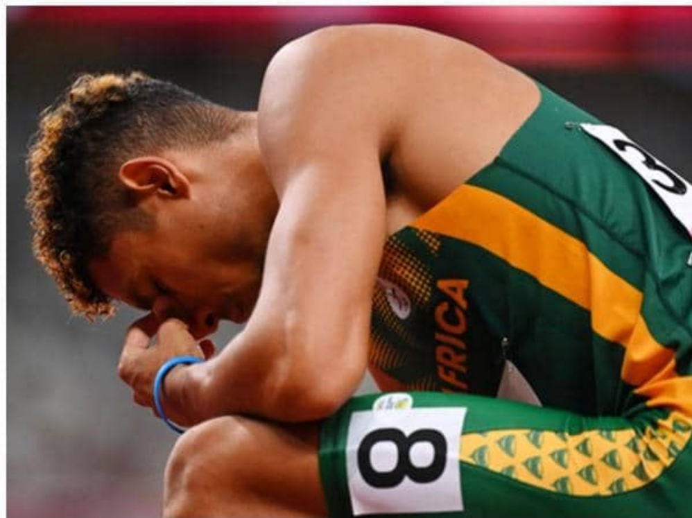
Wayde van Niekerk of South Africa before competing in the 400m Semi-final 3 on Monday.

Amos's silver in London, in that famous race in which Rudisha shattered the world record, remains Botswana's solitary Olympic medal in 10 previous editions of the Games. -SUPERSPORTS