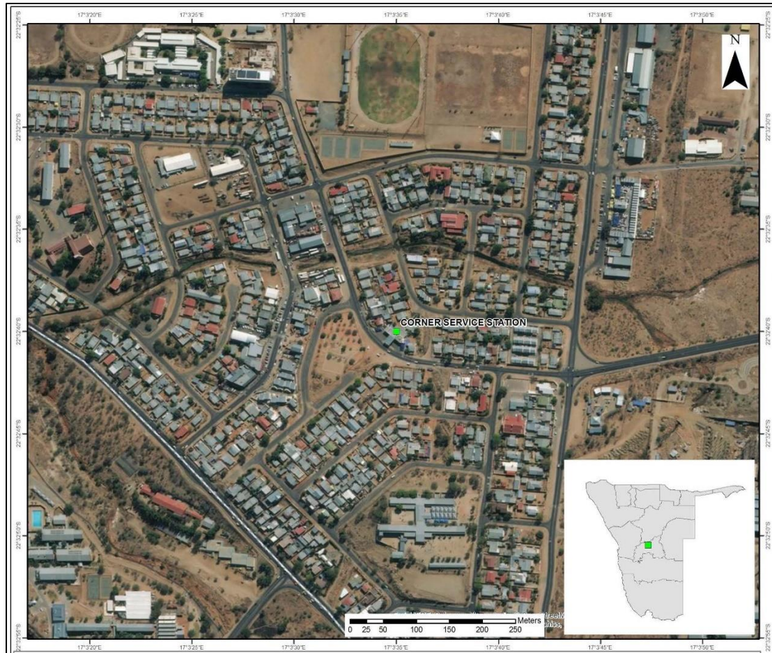
Figure 1: Locality Map of Corner Service Station (Engen, 2017)

In terms of the Environmental Management Act 7 of 2007 (Government Notice No. 29), certain activities may not be undertaken without an Environmental Clearance Certificate (ECC). This activity is included in the above-mentioned list, with particular reference to the following activities of the gazetted Namibian Government Notice No. 30 Environmental Impact Assessment Regulations: Activity 9.2 Any process or activity which requires a permit, licence or other form of authorisation, or the modification of or changes to existing facilities for any process or activity which requires an amendment of an existing permit, licence or authorisation or which requires a new permit, licence or authorisation in terms of a law governing the generation or release of emissions, pollution, effluent or waste.