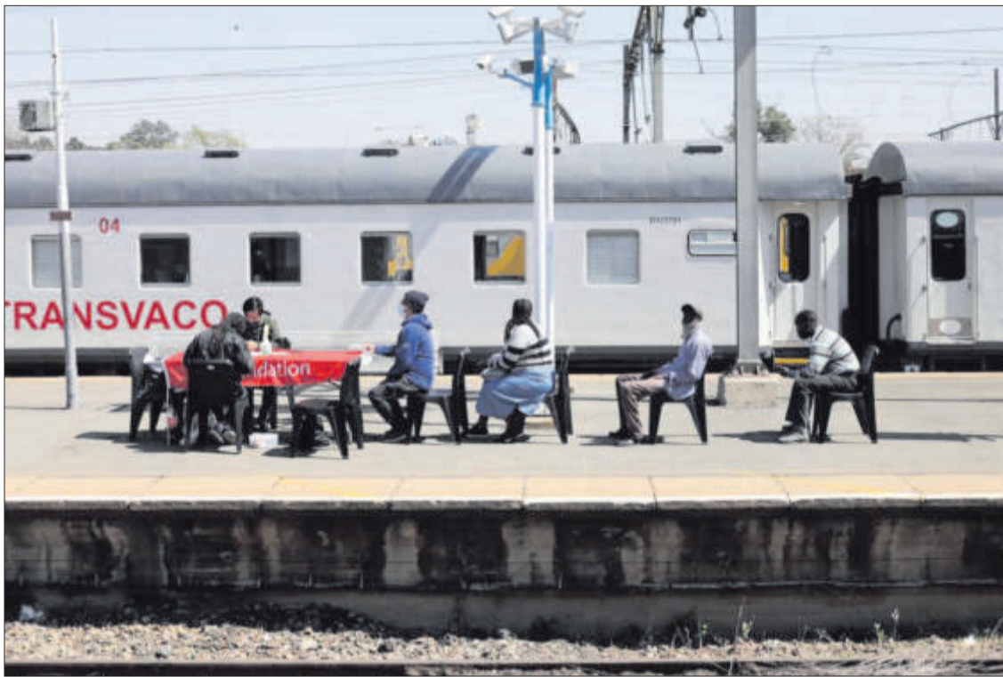
South Africa has vaccinated more than 12 million people after its campaign took off.

for this moment for a very long time," she told Reuters after receiving her Johnson and Johnson jab.