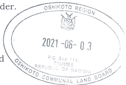
Secretary: Oshikoto Communal Land Board