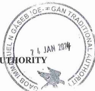
IMMANUEL #NU-AXAB /GÂSEB GAOB OF THE !OE-#GAN TRADITIONAL AUTHORITY