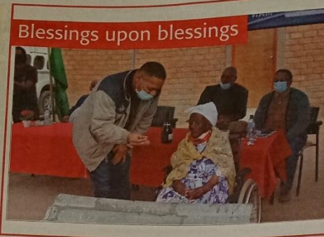
Blessings upon blessings

The suspect (26) has been arrested. - nashipala@nepc.com.na