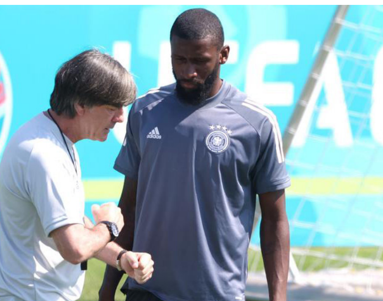
Antonio Ruediger and Ilkay Gundogan returned for Germany's final training session on Monday

For now, Portugal turn to next year's World Cup in Qatar, needing to find a way to illuminate not just Ronaldo but those coming up behind him.