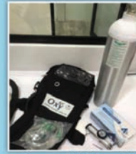
Oxygen Cylinder with respiratory