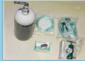
Oxygen Cylinder with Respiratory and Oxi Meter

DPI HEALTH Contact: 0812029137 Email: destinyplannerinv@gmail.com Location: Number 9 Rossini Street Windhoek West