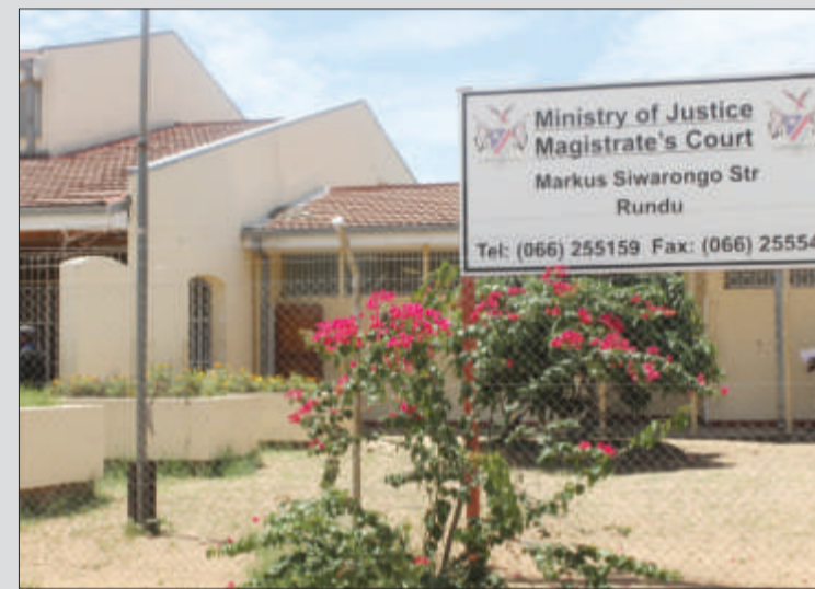
No bail... The Rundu Magistrate's Court.