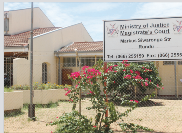
No bail... The Rundu Magistrate's Court.