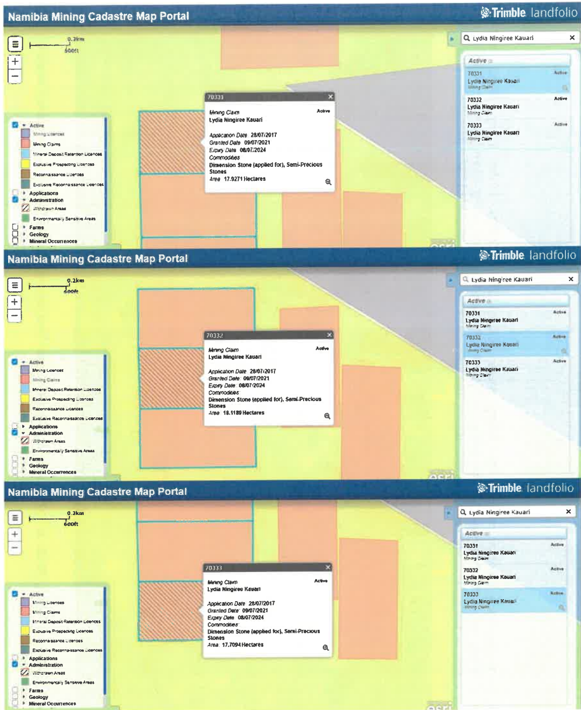
Figure 2: The 3 mining claims for the proposed dimension and semi-precious stone mining activities (Shown above by the blue quadrant). (MME portal, 2021).