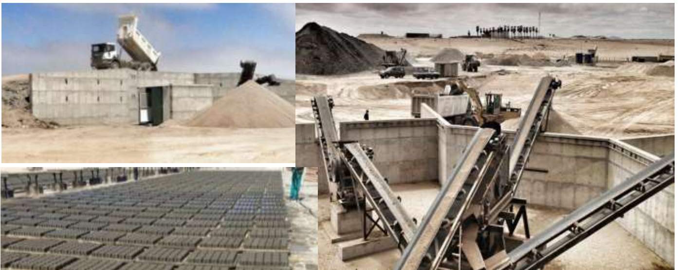
Figure 5: Use of gravel overview

The gypsum sand is required for a variety of purposes, including making concrete, backfill for houses footings, and maintenance of gravel roads and landscaping in Swakopmund town.