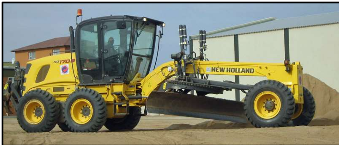
Figure 4 Plant and Equipment used for gravel mining