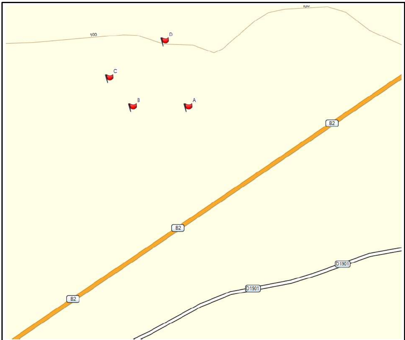
Figure 1: Locality for the gravel mining site for Refuse Solution

The site is located at about 11.5 km east of Swakopmund on the remainder of Portion B of Swakopmund town and townlands No. 41, about 700 m north of Nonidas and the B2 road.