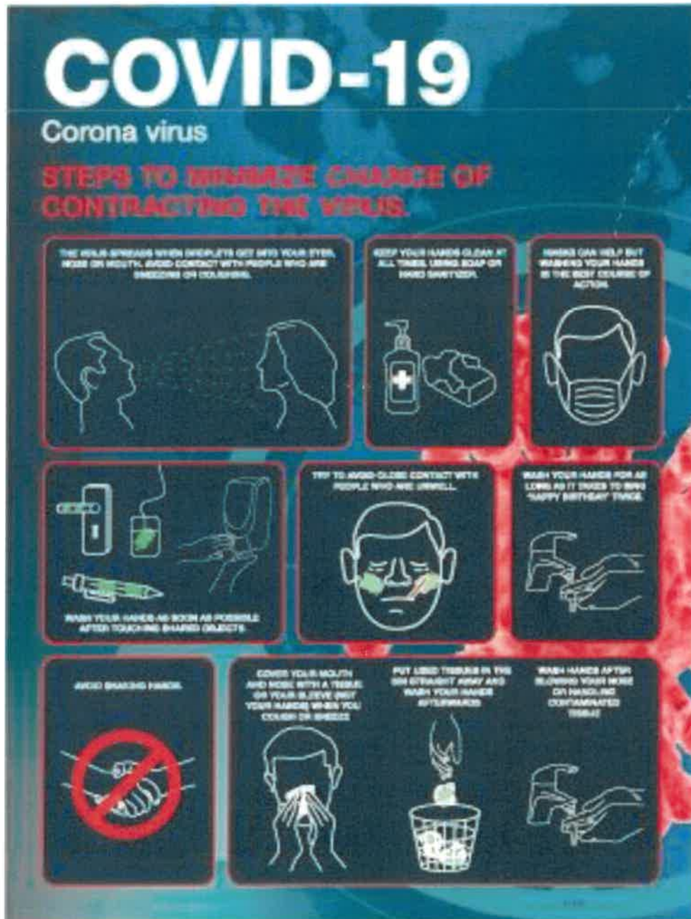
Figure 1: Typical COVID-19 information poster to be placed at designated areas at the mining sites.