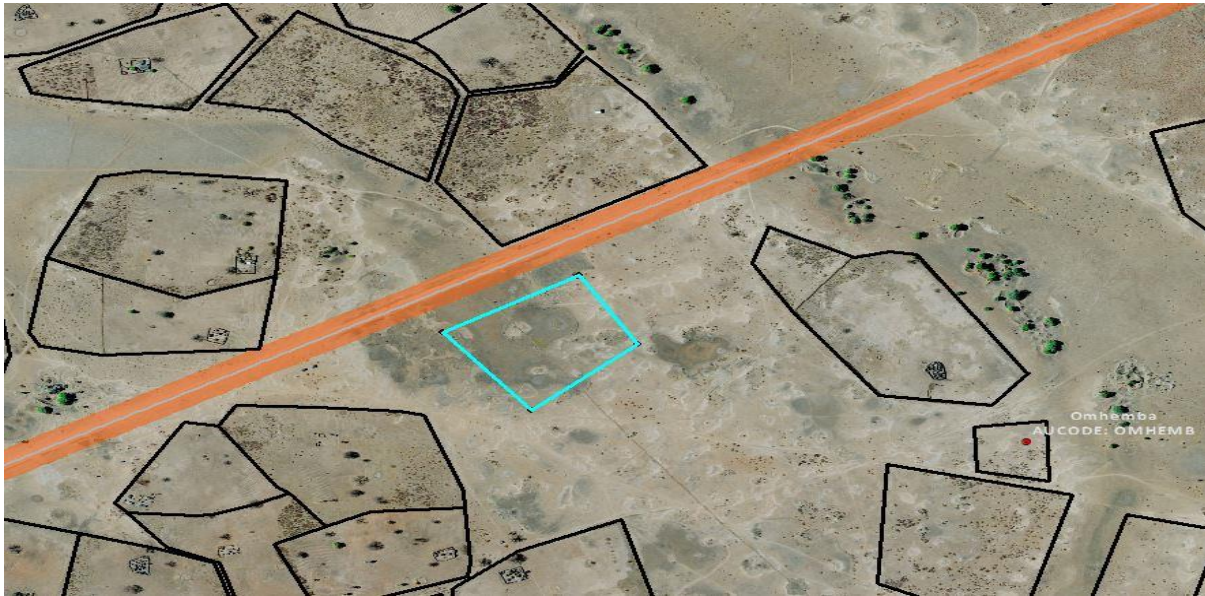
FIGURE 1: LOCATION MAP