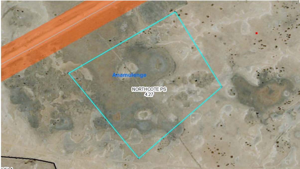
FIGURE 2: LOCATION MAP OF NPSS