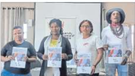
THE TIME IS NOW: The Diversity Alliance of Namibia launched a report on a discussion it held last year on the sodomy law.

The Diversity Alliance of Namibia (DAN) has reiterated its stance on what it called the "archaic" sodomy law. Sodomy is criminalised by the Roman-Dutch common law of Namibia, which was inherited from South Africa at independence. While the sentence for those found guilty under this law is not clear, currently, the legislation - along with the common law crime of "unnatural sexual offences" - criminalises consensual sexual acts between men. DAN, an umbrella network of over 10 LGBTQI human rights organisations in Namibia, made its stance clear at a media information-sharing workshop held at Heja Lodge last weekend. A report detailing considerations from a panel discussion held early last year was also launched at the two-day media convening.