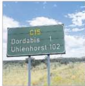
Inwoners van Dordabis wil hê die regering moet ingryp.

Die nedersetting, wat die tuiste van sowat 1 000 mense is, val onder die Windhoek andelise-kiesafdeling.