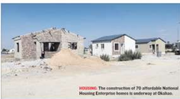
HOUSING: The construction of 70 affordable National Housing Enterprise homes is underway at Okahao.

Economic exclusion Members of the LGBTQI community emphasised the fact that they are economically excluded. "We should understand that we cannot have a healthy, equal, equitable economy within the country if we do not have a healthy society - if we live in a society that does not want to unlearn their modes of oppression. "So, this is why I think Namibia should strive for economic inclusion. When I speak about economic inclusion, I mean ensuring there is structural change that allows LGBTQI persons to be able to fully, equitably and equally participate in the economy. "We are all serious about this country," one of the community members, who preferred to remain anonymous, said.