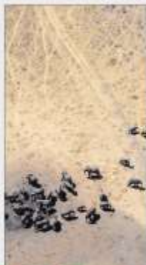
CONSERVATION INITIATIVE: A report on the first-ever synchronised and coordinated aerial survey of Africa's largest savannah elephant populations will be made public by May/June.