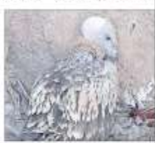
Die Kaapse aasvoëlkuiken met die naam Phoenix. 1503 ARSIF