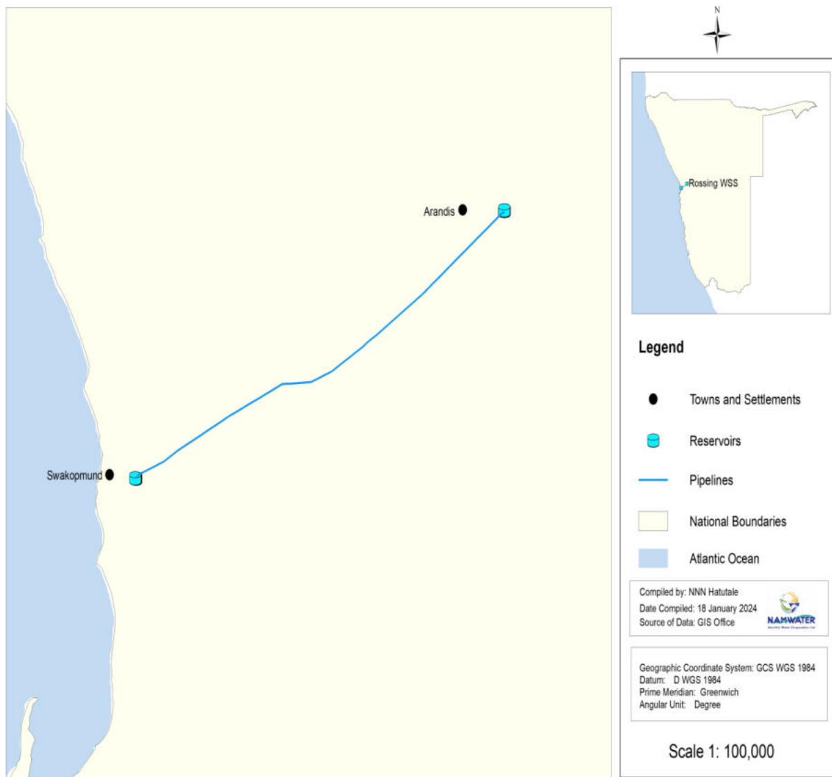
Figure 1: Swakopmund-Rössing Location Map

The EMP is for an existing scheme and it is therefore only for the operation and maintenance of the scheme.