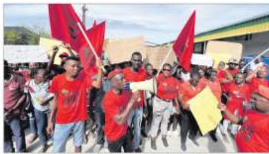
FED UP: NEFF last week staged a demonstration in Oshakati.