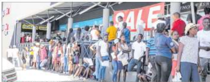
MORE TIME: The Swapo Party Youth League has urged government to extend SIM registrations beyond the 31 December deadline.

"The deactivation of unregistered SIM cards will have a negative impact, not only on the two state-owned mobile telecommunications companies, but also on the economy of the country at large, due the significant reduction in transactions