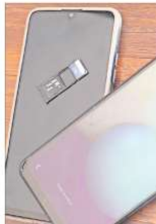
Simkaarte moet voor 31 Desember geregistreer wees, anders kan die selfoonnommer tot niet gaan.