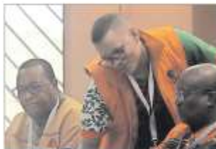
STRONG FOUNDATION: The Landless People's Movement has resolved that its current leaders will continue in their positions for the next five years.

"Our youth, the youth, women and elders still need to develop further and strengthen these for-