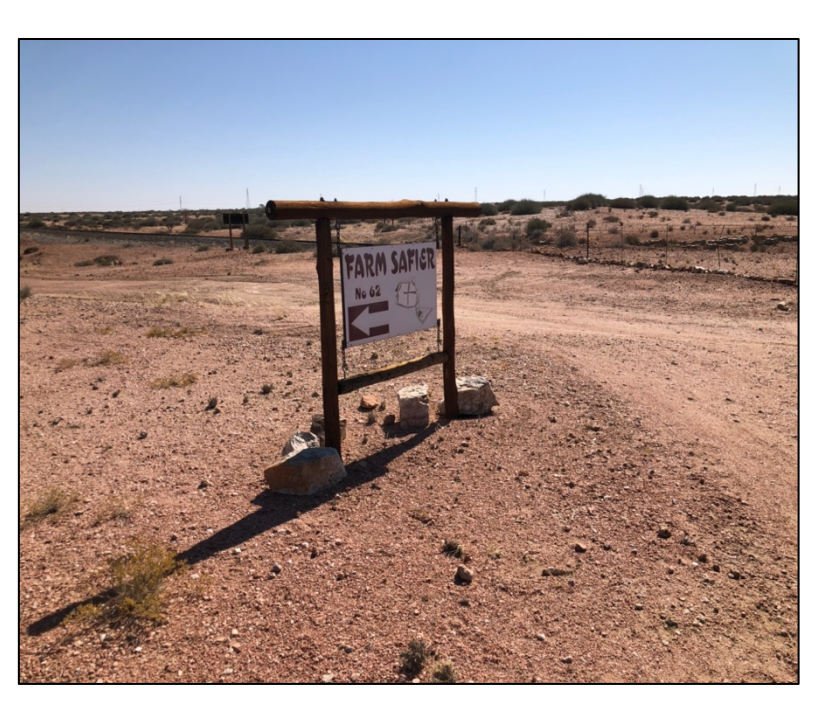
Figure 1: Farm Safier Access

The project Locality map is on Figure 2.