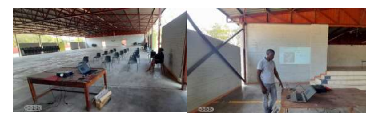
Ngweze hall community Meeting