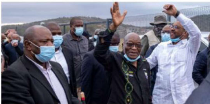
Jacob Zuma waves to supporters in front of his rural home in Nkandla, KwaZulu-Natal province on July 4.