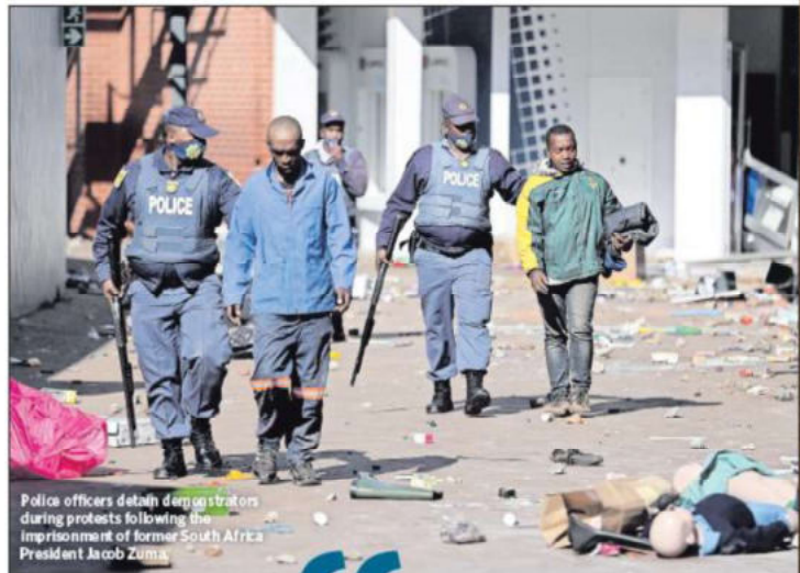
Police officers detain demonstrators during protests following the imprisonment of former South Africa President Jacob Zuma.

an expert panel with analysing his government's preparedness and reaction. He is expected on Thursday to say what action the government