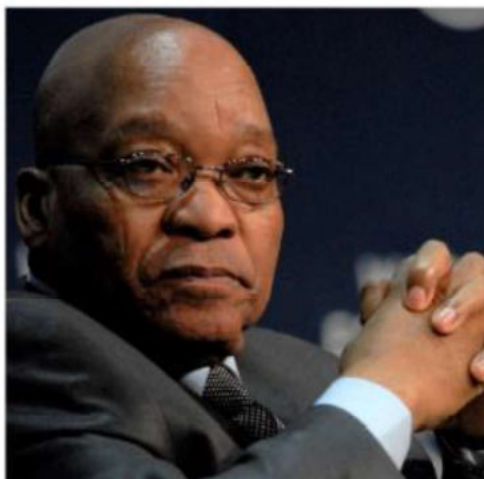
Former SA president Jacob Zuma

All this was triggered by a long-brewing spat between Zuma, the Zondo