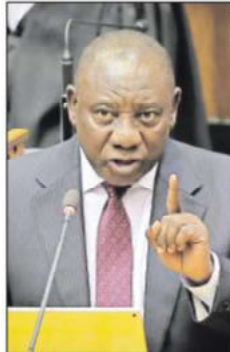
South African President Cyril Ramaphosa.

South Africa's police and intelligence services failed to anticipate and disrupt days of arson and looting last year in which more than 300 people died, a report into the unrest commissioned by the president and released on Monday found. The violence was sparked by the imprisonment of former president Jacob Zuma for defying a court order to testify at a corruption inquiry and fanned by anger over the poverty and inequality that persist almost three decades after the end of apartheid, read more. The government deployed soldiers to restore calm, but around R50 billion (US $9.2 billion) of damage was caused by one estimate as shops were ransacked and key infrastructure targeted. President Cyril Ramaphosa tasked