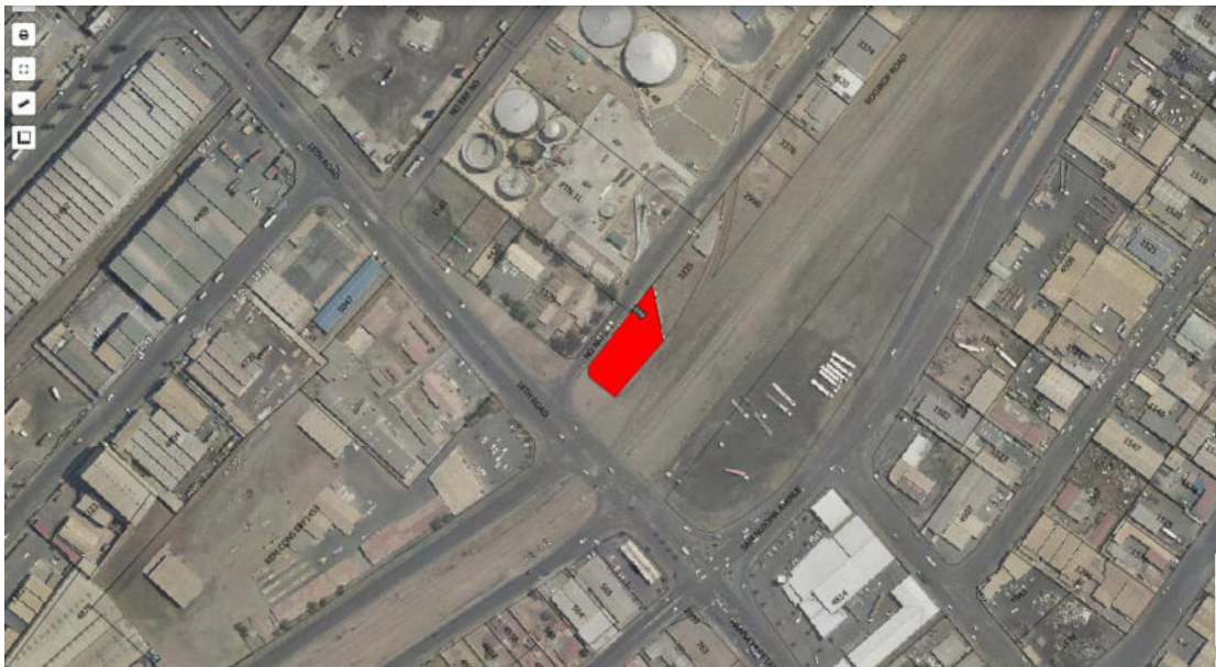
Figure 1: Locality of Erf 3236

The proposed site for the warehouse, Erf 3236 is situated at the corner of Rooikop road and 18 th Road in the industrial area of Walvis Bay in Erongo region, approximately 2 km from the Namport harbour as shown in Figure 1. The coordinates for the proposed warehouse location are 22.945658° S and 14.512109° E (figure 2). The site for the proposed Warehouse construction and operation is alongside existing industrial infrastructure, for example the ones run and managed by gas and petroleum companies, Engine Namibia, Puma and Afrox. The site is easily accessible, as it is linked to the railway and roads network in Walvis Bay.