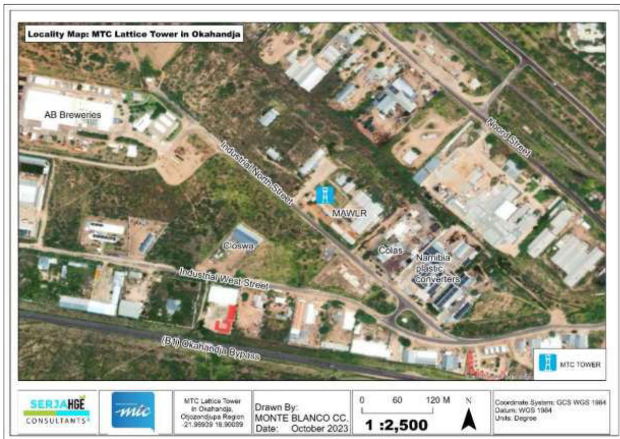
Figure 1-1: The Locality map of the 25m MTC lattice tower in Okahandja Town

The 9m x 9m project site (footprint) is located on the premises of the Ministry Agriculture, Water and Land Reform (MAWLR)’s Otjozondjupa South Regional Services in the Industrial North Street (GPS coordinates -21.96939 16.90089). The locality map is provided in Figure 1-1.