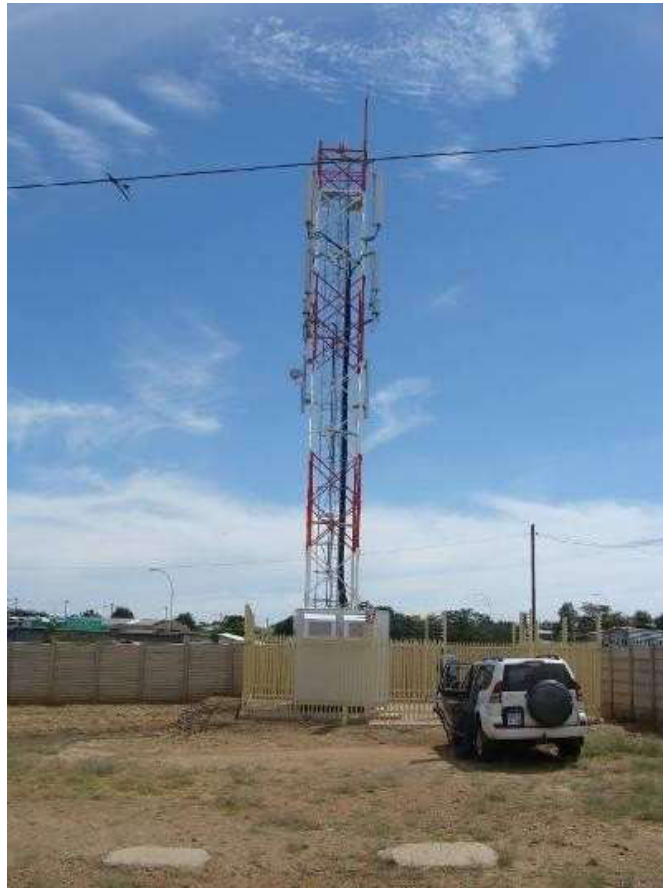
Figure 2-1: A typical red and white painted lattice tower structure

The structure will be mounted to a concrete foundation and will not require any supporting cables. The physical assembling of the network structure and the construction of the foundations will take place on the site by using manual labour as far as possible. To protect the network structure from lightning, it will be earthed. Lattice tower are self-supporting structures that are generally made out of steel and usually painted in red and white colour. An example of a typical lattice tower structure is shown in Figure 2-1 below.