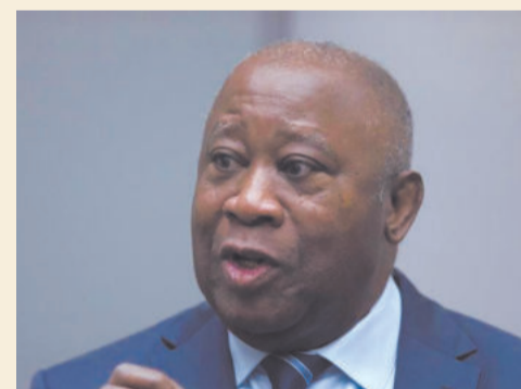
Iipotha yaLaurent Gbagbo oya li ya ekelwahi kompangu yopaigwana yo-ICC

Omupresidente gwopaliamende yaIvory Coast ngoka wo e li amushanga gwongundu yaOuattara yo-RHDP okwa li a ti Gbagbo na galukile moshilongo ashike inapu ningwa ehambelelo opo ku simanekwe iihakanwa yikolokosha mbyoka a li a shongo sho a tindi okutaamba ko iizemo yomahogololo mo2011.