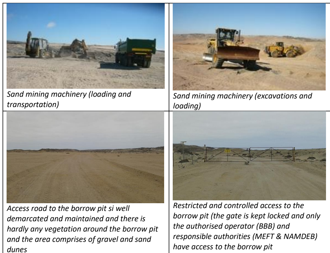
Figure 2-2: Current Sand Mining Activities at the (Borrow pit)

The lack of vegetation within and around the borrow pit implies that no, or very little vegetation will be affected by the sand mining activities (Figure 2.3).