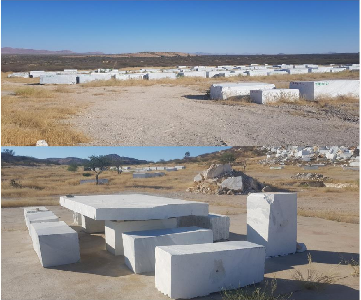
Figure 5: Marble blocks extracted from the quarry area

During the quarrying process, the proponent removed overburdened materials and broken blocks to be used for the mining closure phase (Figure 6 and 7). The EMP indicates that the proponent Ms. Brenda Van Der Merwe's site rehabilitation emphasizes the backfilling of sampling/drilling holes and cover with topsoil in areas that will be disturbed by mining/ quarrying activities. These will be but not be limited to the access road, vehicle tracks around the site, removal, and restoration of areas covered by stockpile and rock piles.