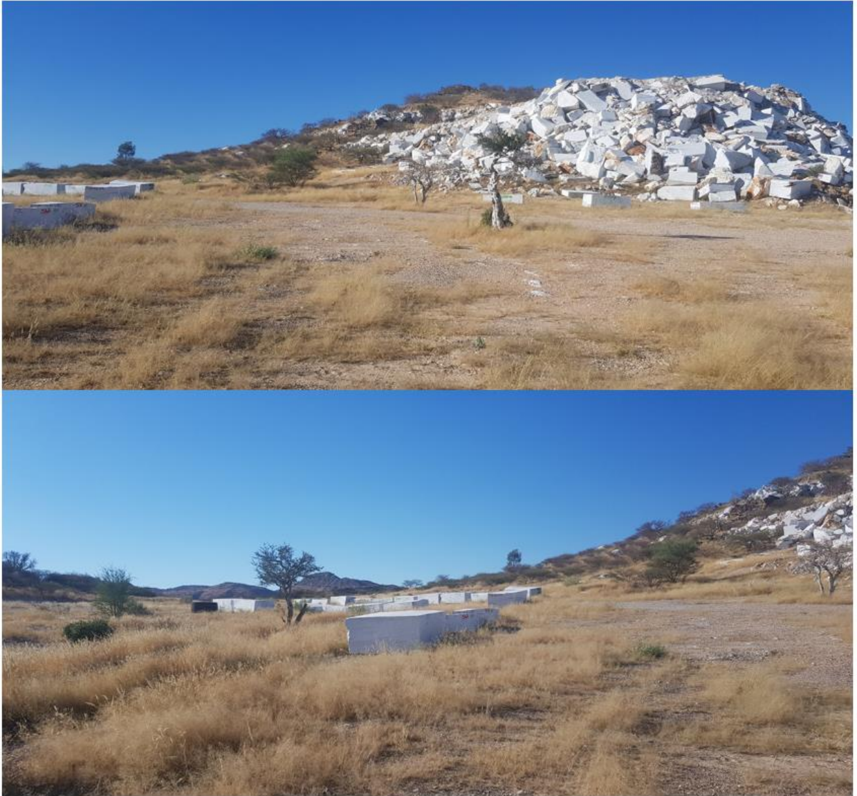
Figure 7: Existing access road in the quarry area