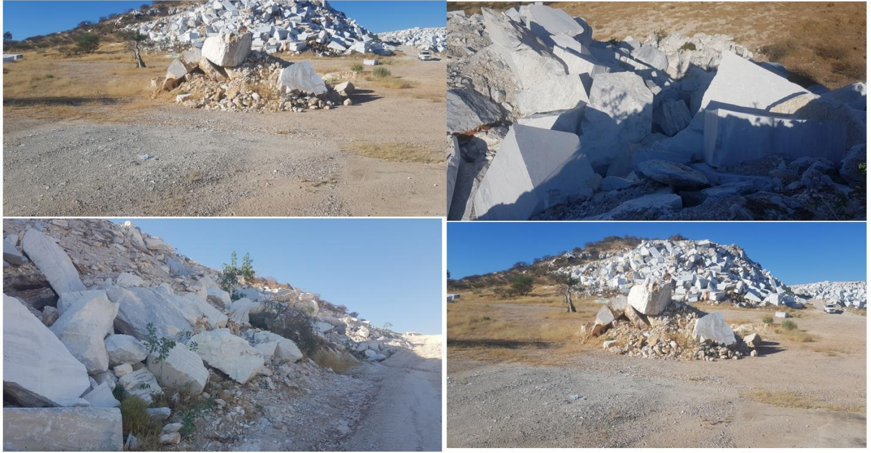
Figure 6: Stockpiles of the broken blocks and overburden materials for use during mining or quarry closure