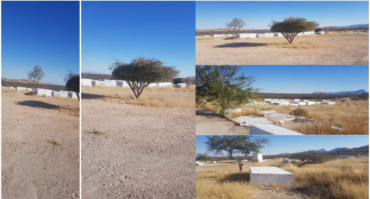
Figure 4: The vegetation and trees in the marble quarry area

EMP. From vegetation and availability of trees point of view, the quarry area was found with trees that were marked not to be removed during the quarrying phase (Figure 4). Vegetation is still very good on-site and the compliance to the provisions of the EMP was found adequate.