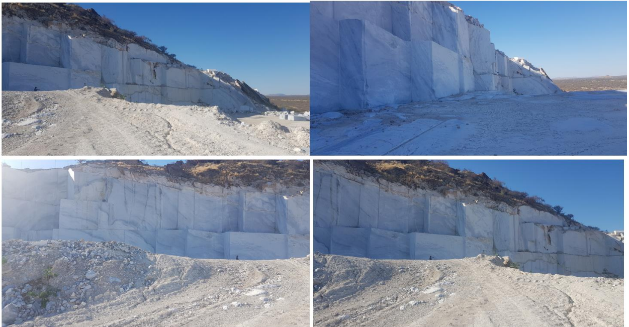
Figure 3: Marble quarry area

To date, the proponent Ms. Brenda Van Der Merwe started with the quarry for marble in 2017 and stopped with the quarrying activities when the ECC expired in 2019. Funds are still available for the quarrying activities to proceed, upon receipt of the renewed ECC. Figure 3, shows the quarry area where marble blocks were removed. Based on the site inspections, there is still enough marble available to be extracted as blocks for commercial purposes (Figure 3).